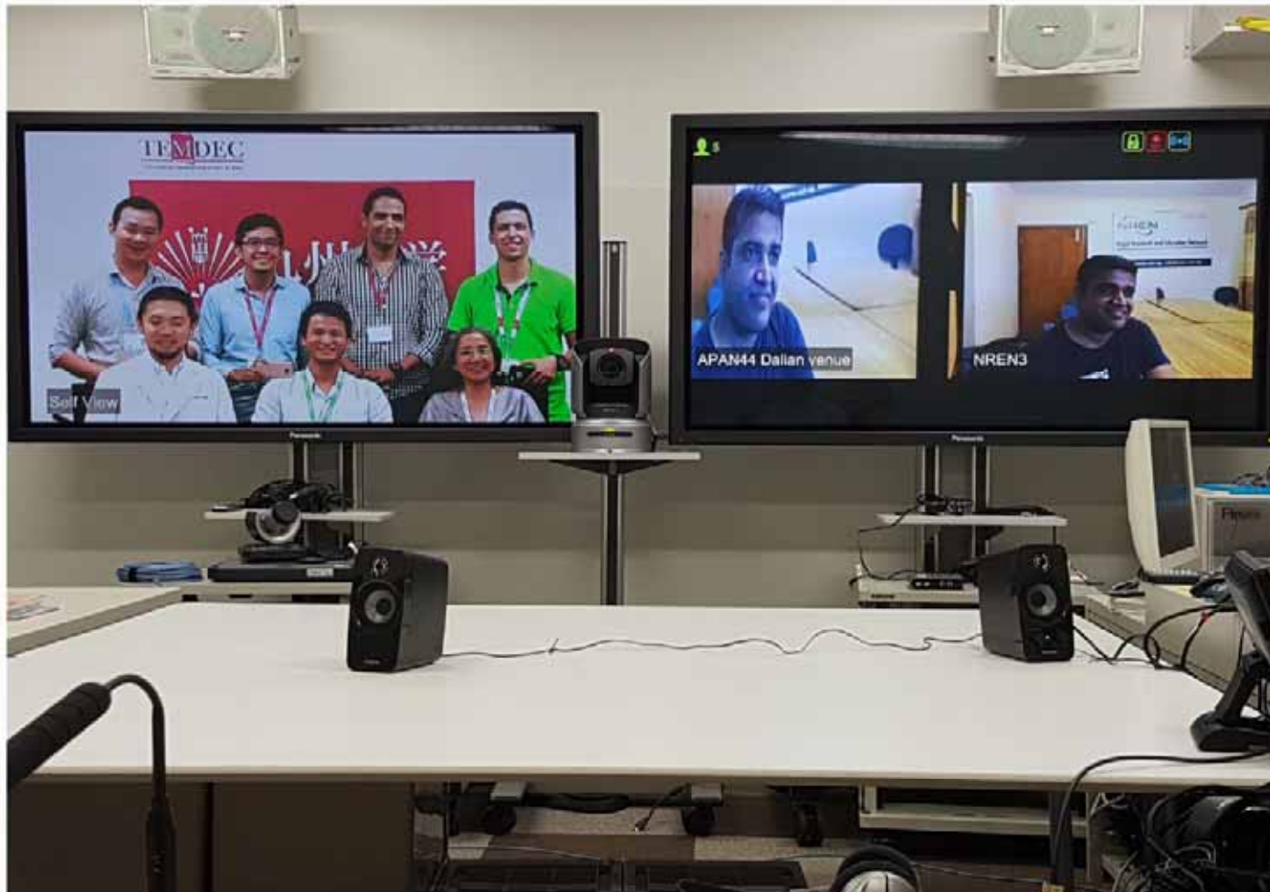
APAN 40 Engineers Workshop