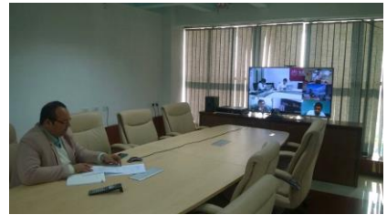
TET online meeting