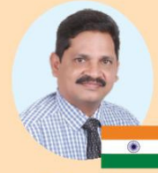
Satya U India