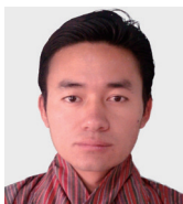
Dr. Sonam Kelzang Central Regional Referral Hospital