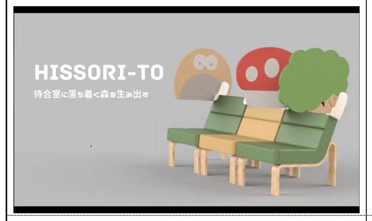
A presented slide

Picture taken at : Kyushu University Hospital