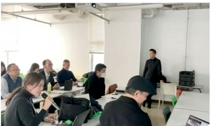
Teleconference view at Kyushu University, Ohashi Campus

Picture taken at : Kyushu University Hospital