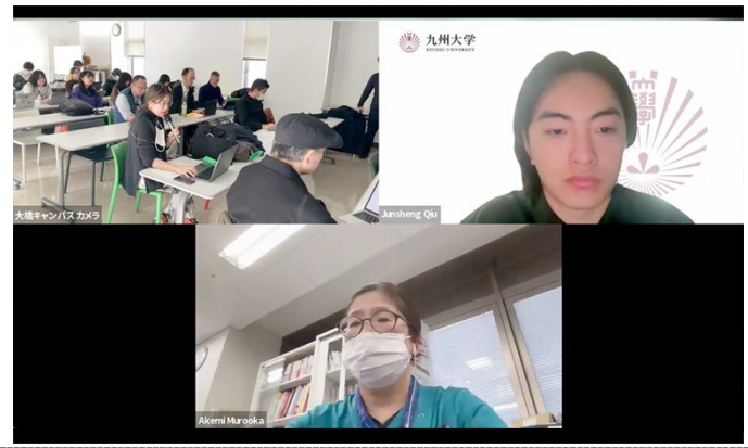
Monitor shows connected sites

The final report of this year's project was conducted. For the waiting area issue in pediatric surgery department, a product for securing personal space and an app design for visualization of waiting time was proposed. A graphic and app design was proposed for the Bangladesh pregnant women's medical checkup issue. The summary of the problems and the beautiful graphic proposals were well received and will continue to be considered as research and implementation after the class.