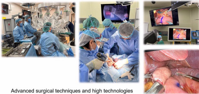
Advanced surgical techniques and high technologies