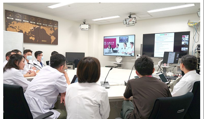
Teleconference view at Kyushu University Hospital

Picture taken at : Kyushu University Hospital