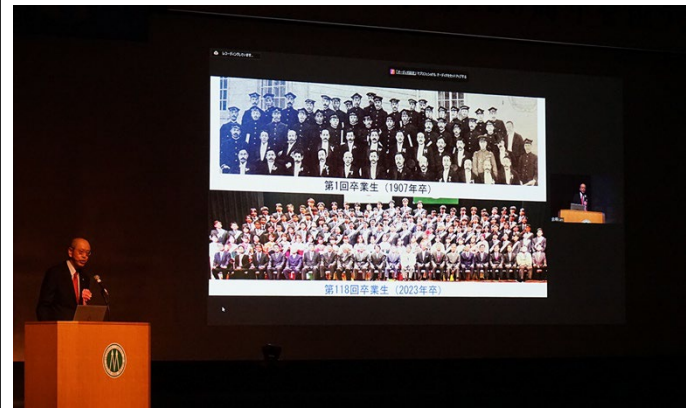
A presented slide

Picture taken at : Kyushu University Hospital