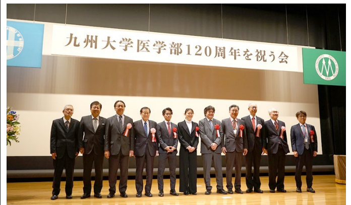
A group photo

Picture taken at : Kyushu University Hospital