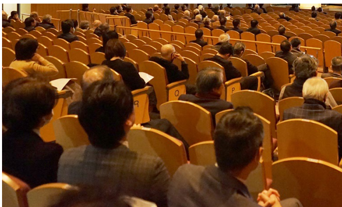
Teleconference view at the venue

Picture taken at : Kyushu University Hospital