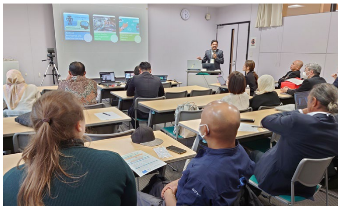
A photo of the main venue

A workshop was held on a project to develop an e-learning program for D-to-D telemedicine in Asia. Experiences and tips on various technical support for telemedicine were shared with university hospitals in Asia, and important elements of the e-learning program were discussed. A doctor from National Cancer Center Hospital also shared their experience in realizing a live endoscopy broadcast by a medical doctor, which stimulated discussion.