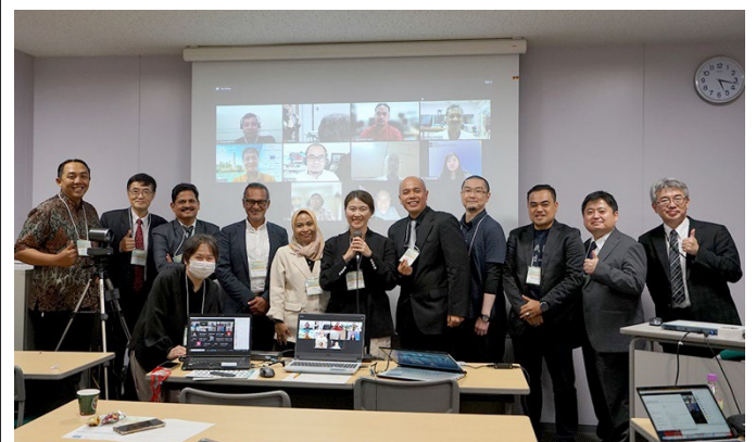
A group photo

Picture taken at : Kyushu University Hospital