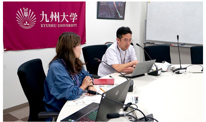
Monitor shows connected sites