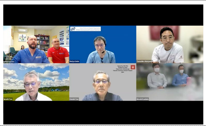
Monitor shows connected sites

The 19th Endoscopy Teleconference with Russia was focused on the endoscopic and histopathological characteristics of gastric neoplasia in challenging clinical cases. Clinical cases of patients with gastric neoplasia were presented; its endoscopic, endocytoscopic, and histological findings were discussed with participants. Interesting questions were asked by presenters, and important recommendations were given by the experts.