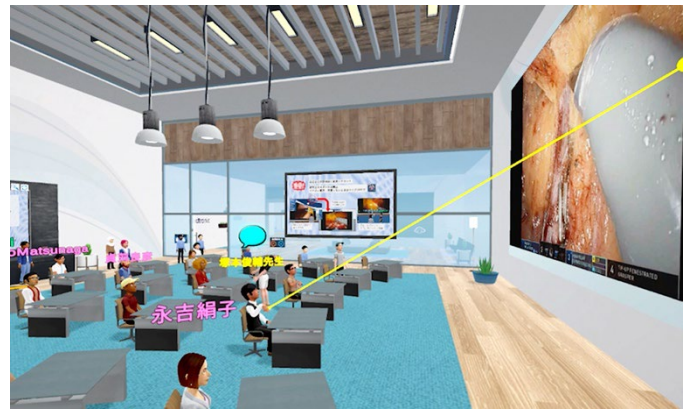
Doctors discussing a case using a laser pointer

Picture taken at : Kyushu University Hospital