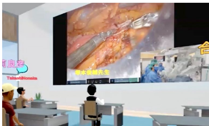
Screen sharing on Virbela

Picture taken at : Kyushu University Hospital