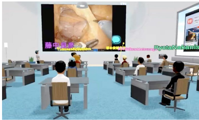
Teleconference view on Virbela

This workshop aims to enhance the highly skilled techniques of colorectal surgeries and promote collaboration among young surgeons in Kyushu. This was the 3rd metaverse conference, and video presentations were given by NCCCH and Nagasaki Univ. We had a lively discussion and meaningful interactions through avatars, making it a highly valuable and significant occasion.