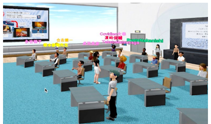
Teleconference view on Virbela

Picture taken at : Kyushu University Hospital