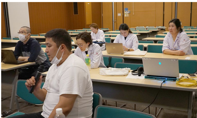
Teleconference view at the main venue

Picture taken at : Kyushu University Hospital