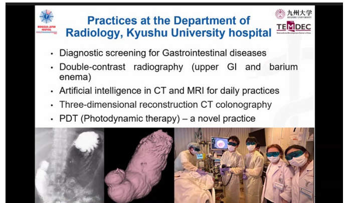
A presented slide

Picture taken at : Kyushu University Hospital