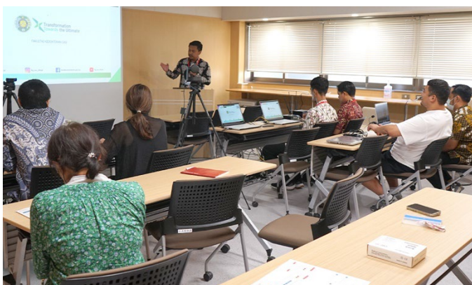
Teleconference view at the main venue

Picture taken at : Kyushu University Hospital