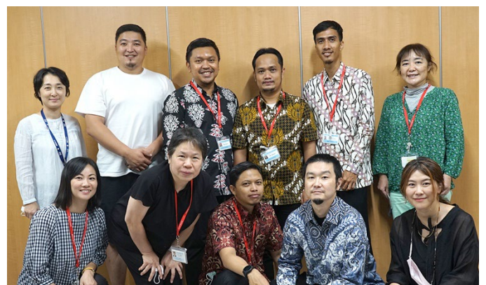
A group photo at the main venue

Picture taken at : Kyushu University Hospital