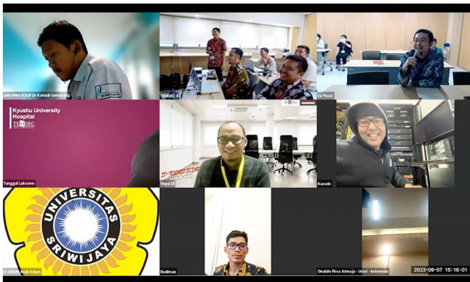
Monitor shows connected sites

In this session, four technicians invited from Indonesia with support from the Telecommunications Advancement Foundation reported on the skills and experiences they acquired over 25 days of training. During the training period, the technicians learned how to set up a hybrid conference room with various configurations, live stream from an endoscopy room, and deliver medical content using VR.