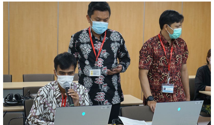
Indonesian engineers establish a connection beside the screen

Picture taken at : Kyushu University Hospital