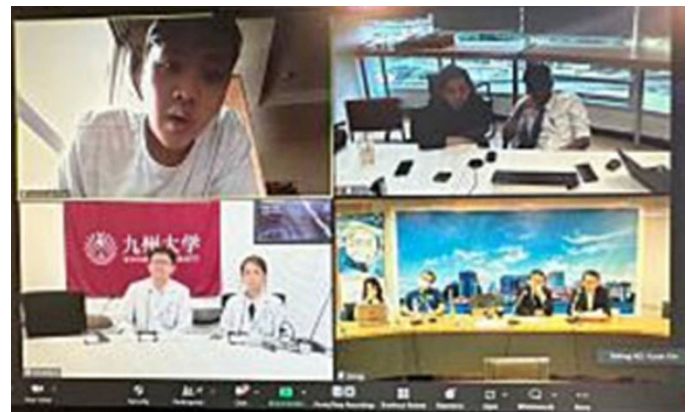
Teleconference view at Mahidol University Siriraj Hospital