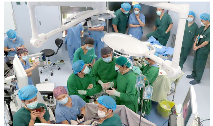
Doctors are performing a surgery

Live laparoscopic surgeries for gastric neoplasm were performed for two days at the Mongolian Japan Hospital. It was impressive to see Mongolian surgeons observing the surgery with great effort and Japanese experts providing technical guidance enthusiastically. On the second day, the first laparoscopy endoscopy collaborative surgery was performed. I hope that this technique will be passed on to future generations and be a standard procedure.