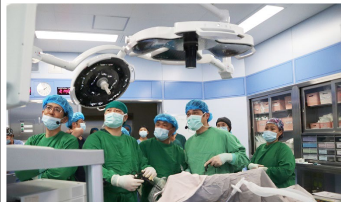
Doctors are performing a surgery

Picture taken at : Kyushu University Hospital