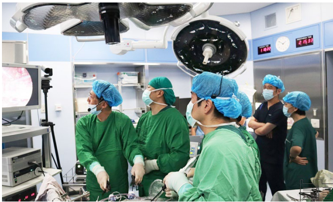
Doctors are performing a surgery

Picture taken at : Mongolia-Japan Hospital