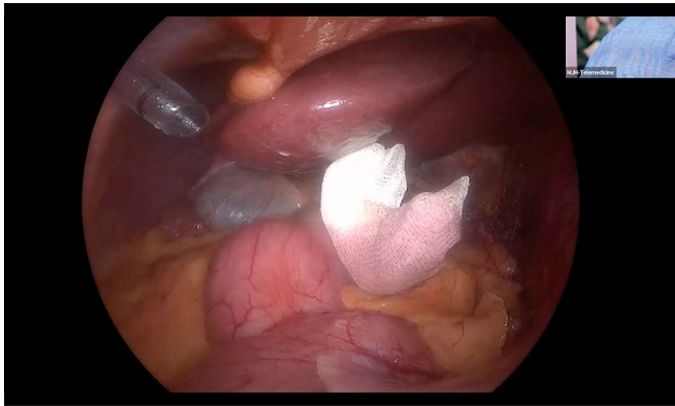
A presented live surgery

Picture taken at : Mongolia-Japan Hospital