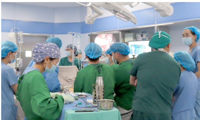
Doctors are performing a surgery

Picture taken at : Kyushu University Hospital