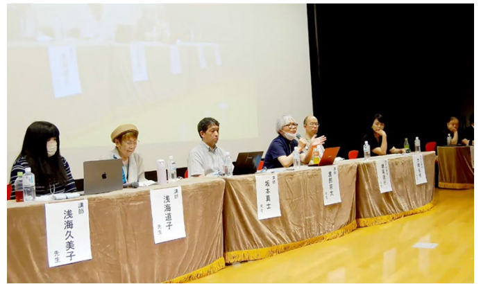
Teleconference view at the main venue

Picture taken at : Kyushu University Hospital