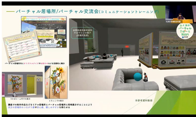
A presented slide

Picture taken at : Kyushu University Hospital