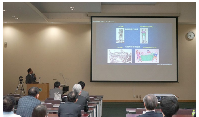
Teleconference view at Kyushu University Hospital

Picture taken at : Kyushu University Hospital