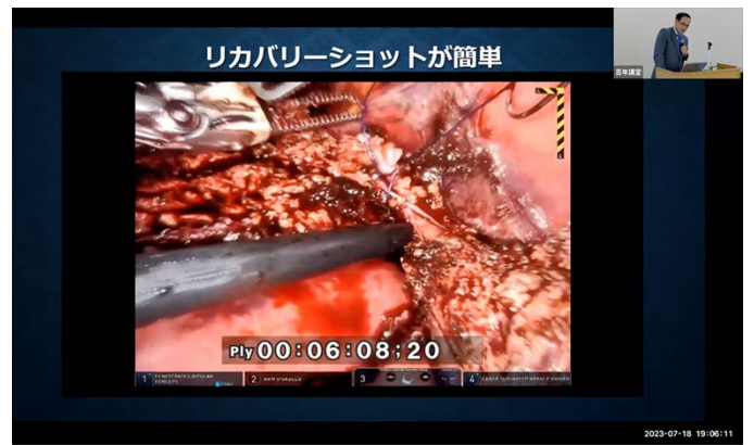
A presented slide

Picture taken at : Kyushu University Hospital