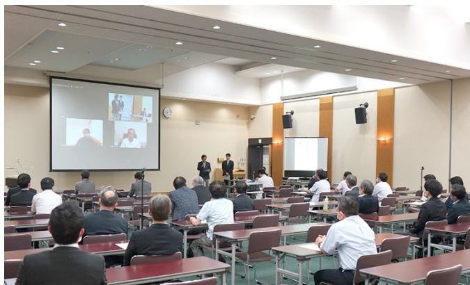
Screen shows connected sites