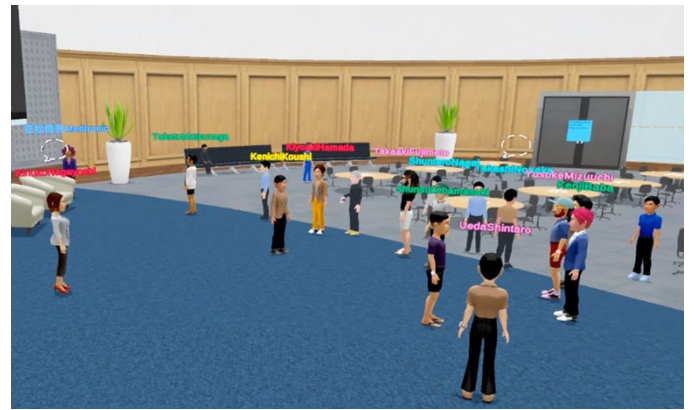
Participants enjoy interactive communication

Picture taken at : Kyushu University Hospital