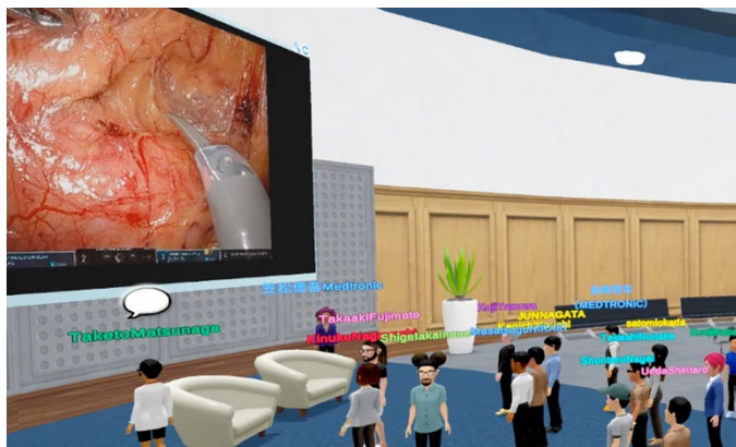
A presented surgical movie

Picture taken at : Kyushu University Hospital