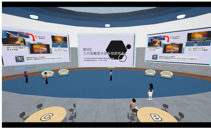
Teleconference view on Virbera

This workshop aims to enhance the highly skilled techniques of colorectal surgeries and promote collaboration among young surgeons in Kyushu. The event took place in the metaverse room, where video presentations were given by three hospitals. We had a lively discussion and meaningful interactions through avatars, making it a highly valuable and significant occasion.