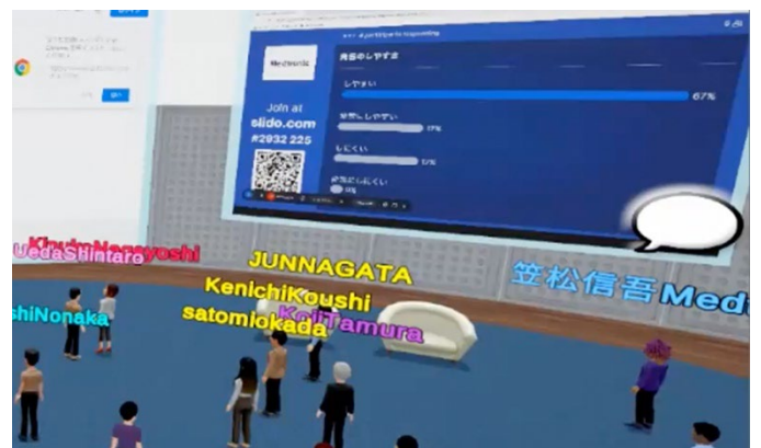
Monitor shows live poll using slido

Picture taken at : Kyushu University Hospital