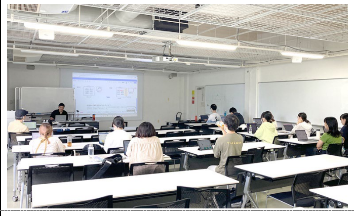
A photo of a class

A workshop was held to generate ideas on issues related to waiting space in department of pediatric surgery. Several designs for products, media, services, and spaces were proposed and discussed from the perspectives of "ensuring privacy," "enjoyable space that does not bore," "making the waiting time visible," and "creating a free waiting time that is not tied down". Participants will pick up ideas they will work on and proceed with prototyping.