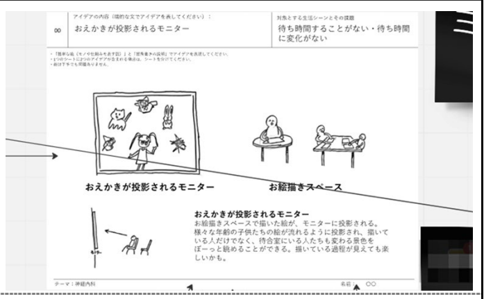
Screen sharing using Miro