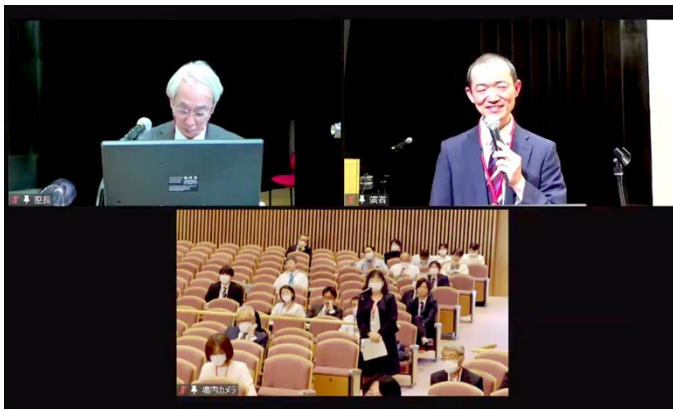
Monitor shows the conference

This was the first hybrid conference held by the Japanese Society of Oral and Maxillofacial Radiology. This was the first time in four years that the event was held onsite, and more than 340 people participated onsite and online. According to the conference theme, "Dental Radiology Up to Date", 1 special lecture, 3 educational lectures, 23 general oral presentations, and 30 general poster presentations were presented.