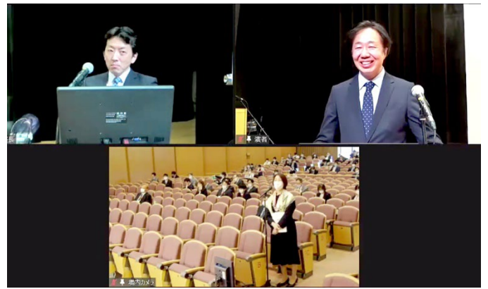
Monitor shows the conference

Picture taken at : Kyushu University Hospital