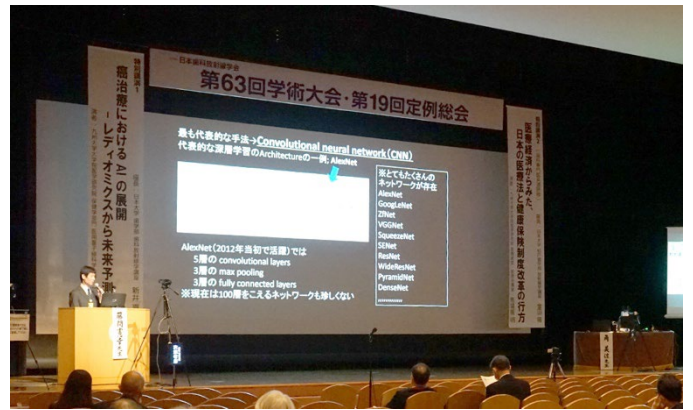
Photo at the main venue

Picture taken at : Kyushu University Hospital