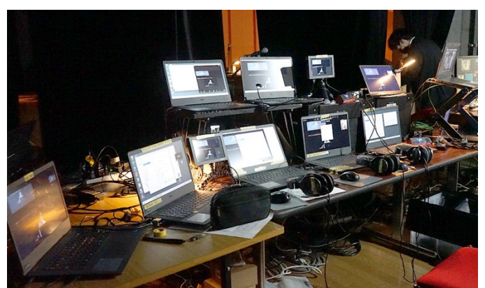
Backyard of the venue responsible for streaming

Picture taken at : Kyushu University Hospital