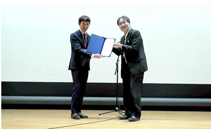
A photo of an award ceremony

Picture taken at : Kyushu University Hospital