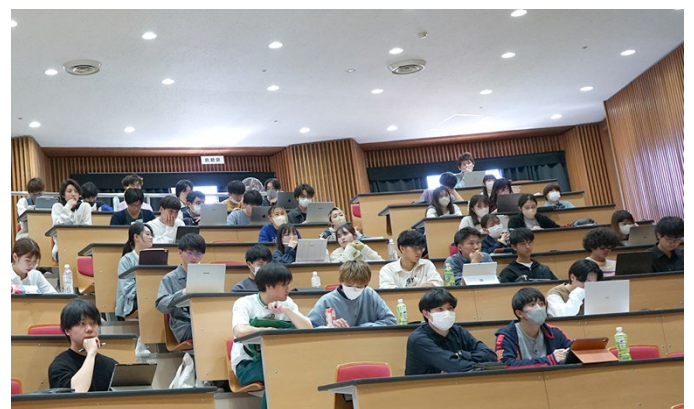
A photo of a class

Picture taken at : Kyushu University Hospital