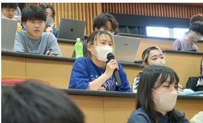
A student asks a question

Picture taken at : Kyushu University Hospital