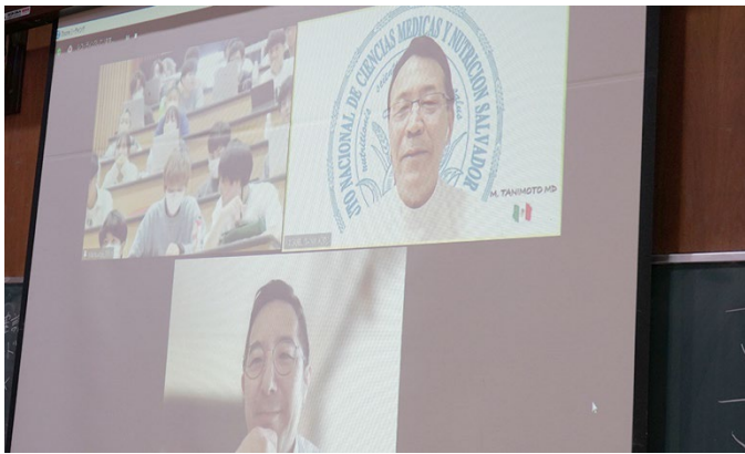
Monitor shows connected sites