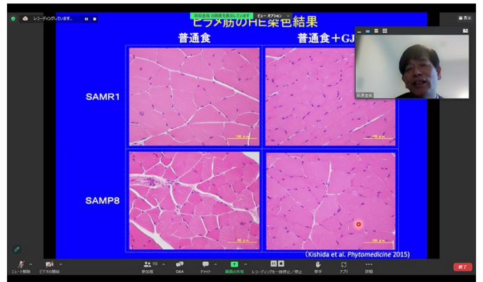
A presentation slide

Picture taken at : Kyushu University Hospital