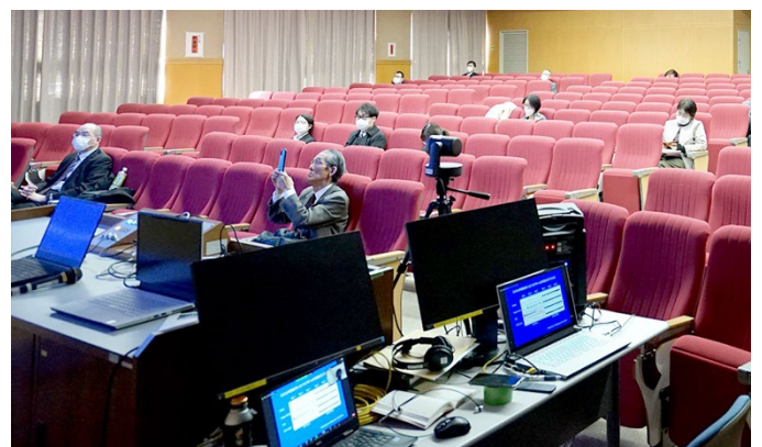
Teleconference view at Kyushu University Hospital

Picture taken at : Kyushu University Hospital