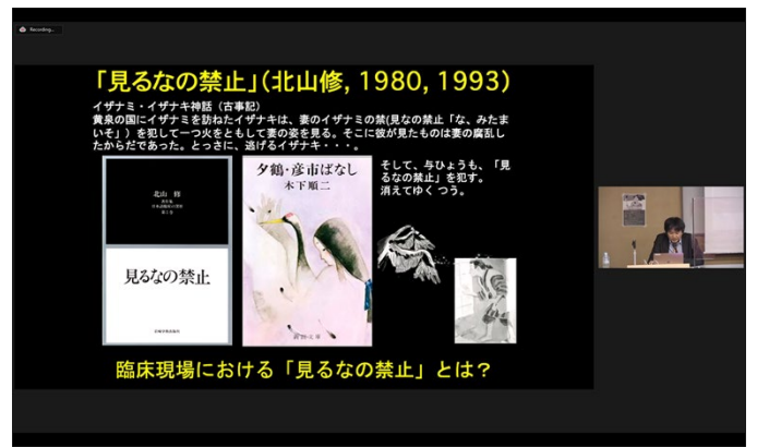
A presentation slide