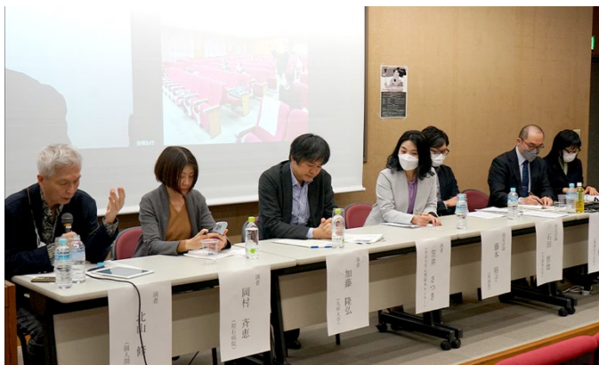
The panel discussion