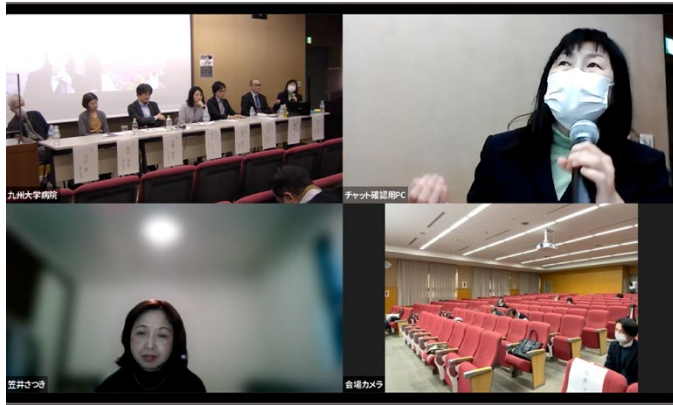
Monitor shows connected sites

Psychoanalysis, created by Sigmund Freud more than a hundred years ago, has contributed greatly to the development of mental health care. Psychoanalysis has developed not only as a therapeutic theory but also as a discipline to understand cultural society from the perspective of the unconscious. In this symposium of the Contemporary Psychoanalytic Society, psychoanalysts and psychotherapists gathered and discussed contemporary issues rooted in Japanese culture and society.