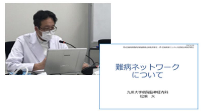
Teleconference view at Kyushu University Hospital

Picture taken at : Kyushu University Hospital