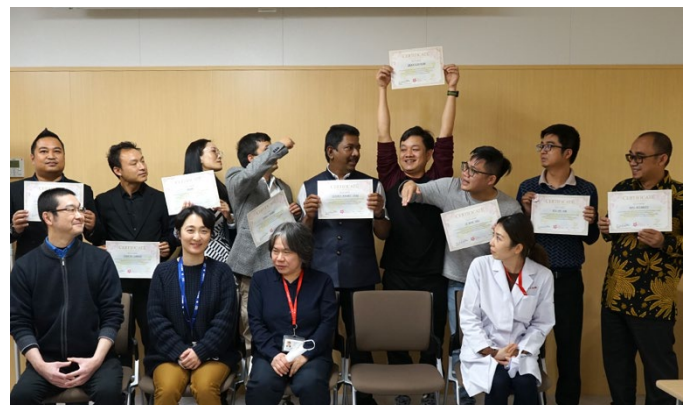
Group photo after the debriefing

Picture taken at: Kyushu University Hospital