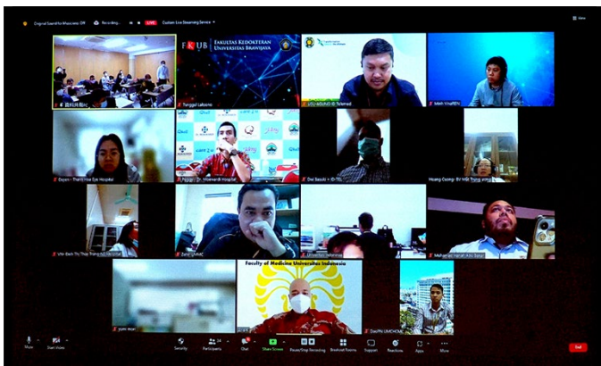
Monitor shows connected sites

In this training report conference session, 4 institutions were giving a presentation about the Sakura science exchange program activities, All the participants expressed that they had precious experience not only in the technology field but in Japanese culture, in the event, everything went smoothly with teamwork from each team. It was a great time, and this program was successful and fruitful for us. Thank you, TEMDEC.