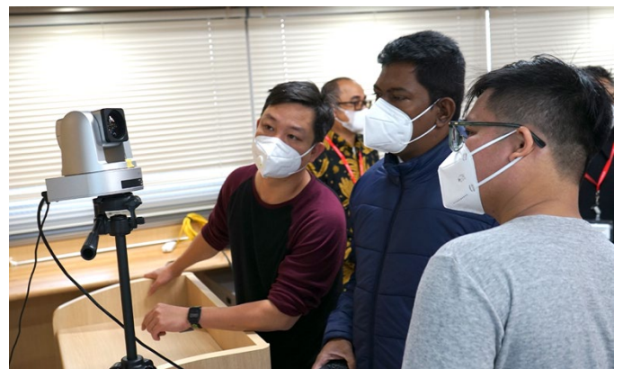
Engineers establish a connection

Picture taken at: Kyushu University Hospital