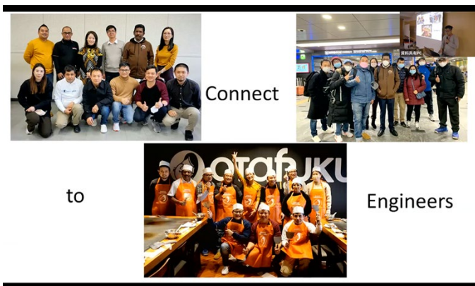
A presentation slide

Picture taken at: Kyushu University Hospital