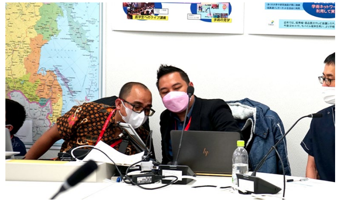
An engineer from Indonesia(It.) establishes a connection