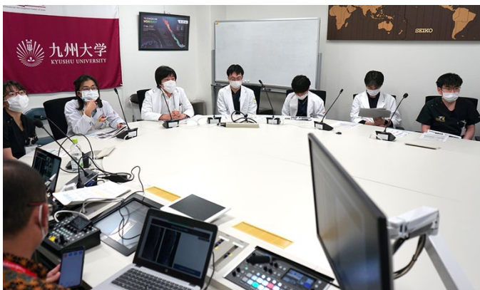
Teleconference view at Kyushu University Hospital