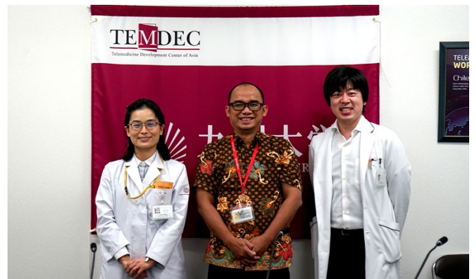
A group photo after the teleconference