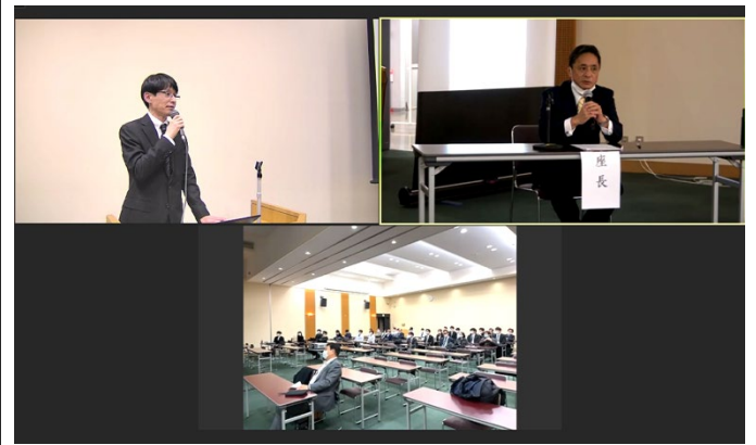
Monitor shows connected sites

Picture taken at: Kyushu University Hospital