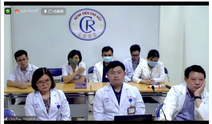
Teleconference view at Cho Ray Hospital