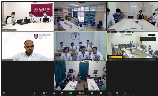
Monitor shows connected sites

The 13th EUS-Asia teleconference was held on January 10, 2023. The video presentations regarding the role of EUS for CBD stone and that for intra-abdominal lymphadenopathy were performed from MARA University and Cho Ray Hospital, respectively. Both presentations were of high quality, demonstrating the usefulness of EUS in various situations. We could share the current status and future perspective of EUS in each country.