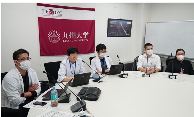
Teleconference view at Kyushu University Hospital