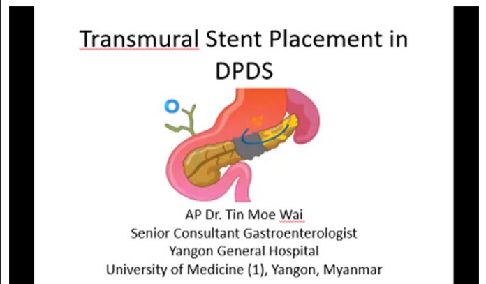
A presentation slide