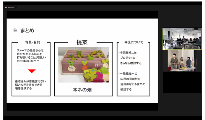
A presentation slide displayed on screen. Picture taken at: Kyushu University Hospital