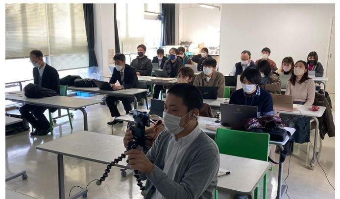
Workshop view at Ohashi Campus. Picture taken at: Kyushu University, Ohashi Campus