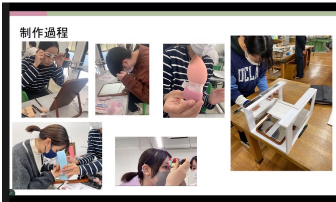
A presentation slide displayed on screen. Picture taken at: Kyushu University Hospital

This year we conducted our project with the general surgery and neurology dept. The theme of the six groups was information design for stoma patients, products for improving proactive cosmetic therapy for patients with incurable neurological diseases, etc. All teams presented created prototypes using the three-dimensional printer, computer programming, drawing, and comments from patients and specialists.