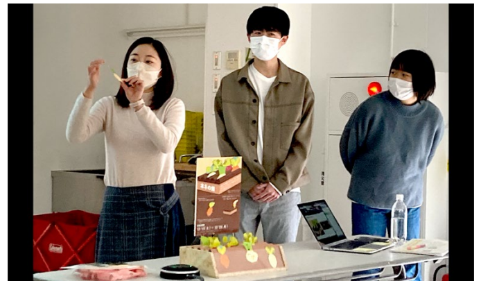
Students make a presentation. Picture taken at: Kyushu University, Ohashi Campus