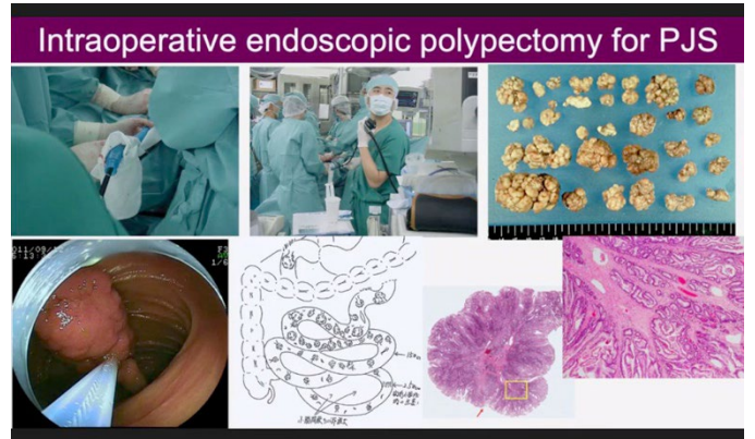
A presented slide

Picture taken at : Kyushu University Hospital