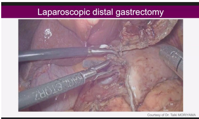
A presented slide

Picture taken at : Kyushu University Hospital