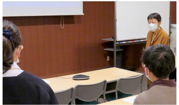
Monitor shows connected sites