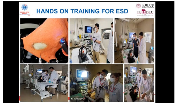
A presentation slide

Picture taken at: Kyushu University Hospital