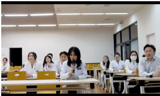
Teleconference view at Mongolia-Japan Hospital

Picture taken at: Kyushu University Hospital