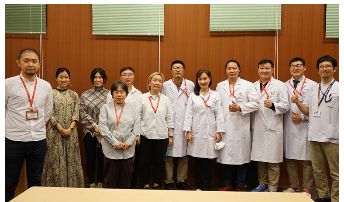
Group photo after the Training Report

Picture taken at: Kyushu University Hospital