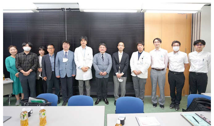
A group photo at Kyushu University Hospital.