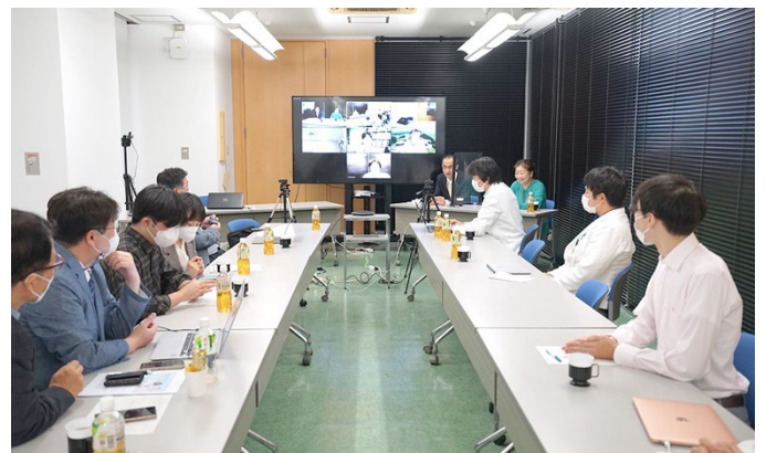
Teleconference view at Kyushu University Hospital.