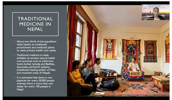
A presentation slide displayed on screen.