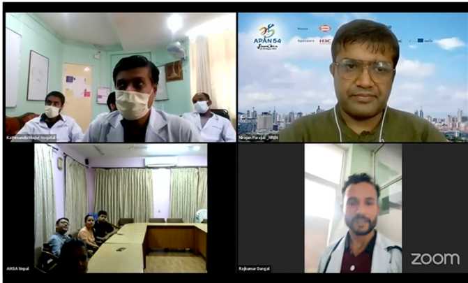
Monitor shows connected sites.