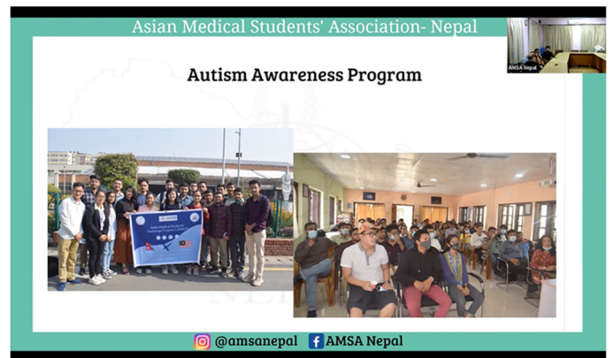
A presentation slide displayed on screen.