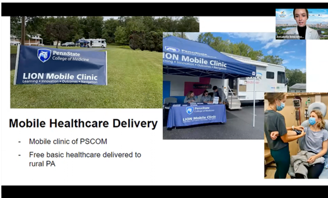
A presentation slide displayed on screen.