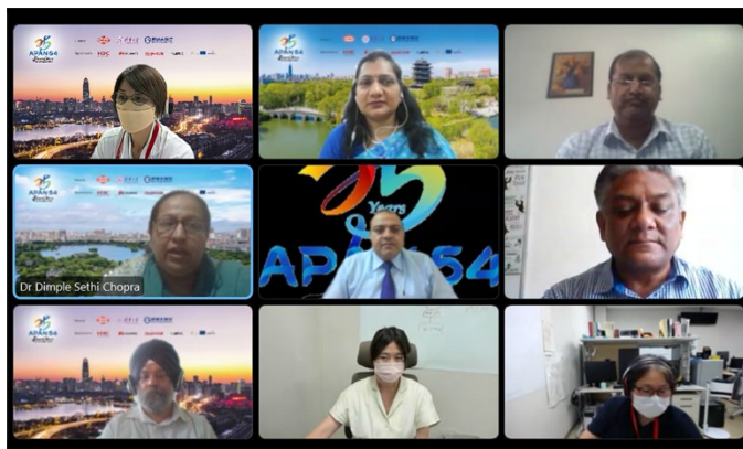
Monitor shows connected sites.