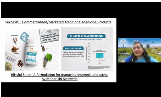
A presentation slide displayed on screen.