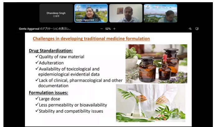
A presentation slide displayed on screen.