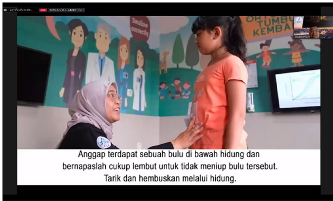
A presentation slide displayed on screen.

Picture taken at: Kyushu University Hospital