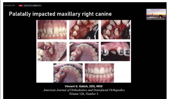
A presentation slide displayed on screen.

Picture taken at: Kyushu University Hospital