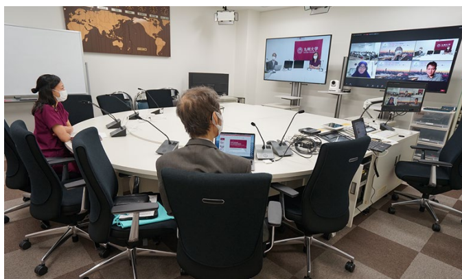
Teleconference view at Kyushu University Hospital.

Picture taken at: Kyushu University Hospital