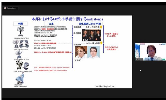
A presented slide.