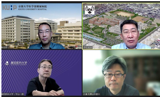
Monitor shows connected sites.

The meeting on minimally invasive gastrointestinal surgery had been held mainly at Fujita Medical College (F), Kyoto University (K), Kyushu University (Q), and their associated institutions. This was the third remote meeting during the Covid-19 pandemic. Three case presentations, one educational lecture, and one special lecture were presented, mainly discussing the latest topics and future prospects of upper gastrointestinal surgery. Both video and audio were smooth, and there was meaningful discussion.