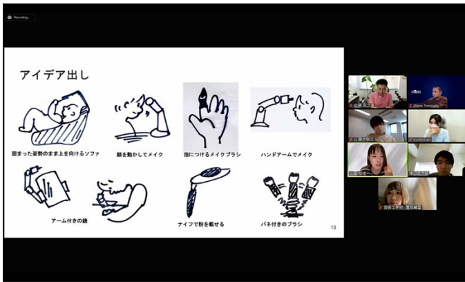
A presented slide.

Picture taken at : Kyushu University Hospital