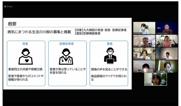
A presented slide.

Picture taken at : Kyushu University Hospital