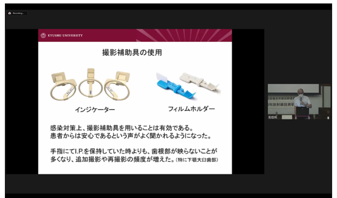
A presentation slide displayed on screen.

Picture taken at: Kyushu University Hospital