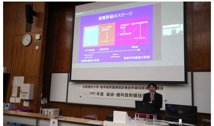
Teleconference view at Kyushu University Hospital.

Picture taken at: Kyushu University Hospital