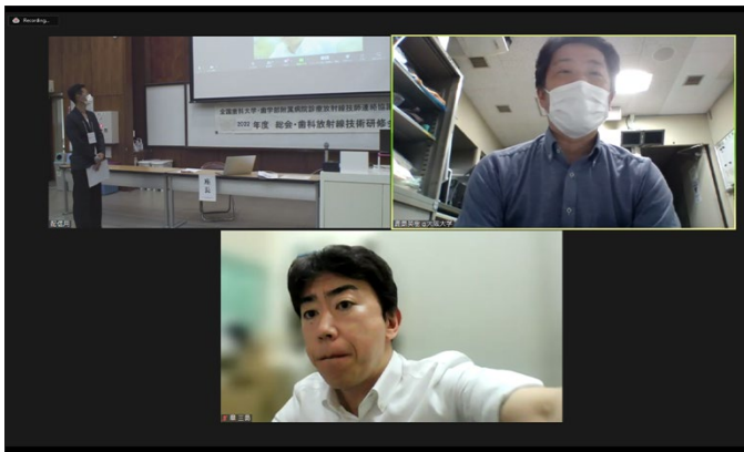
Monitor shows connected sites.

The purpose of this meeting is to improve dental radiological techniques and knowledge mainly in dental university hospitals in Japan. This was the first meeting in 3 years due to the pandemic. Although hybrid style combining onsite and online is the first attempt for us, this will become common in the future. This meeting is the good opportunity for many radiological technologists to improve their skills and knowledges.