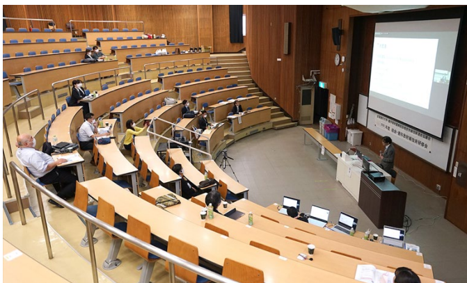
Teleconference view at Kyushu University Hospital.

Picture taken at: Kyushu University Hospital