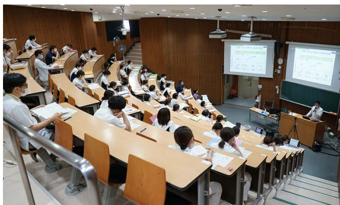
Workshop view at Kyushu University Hospital.

Picture taken at: Kyushu University Hospital