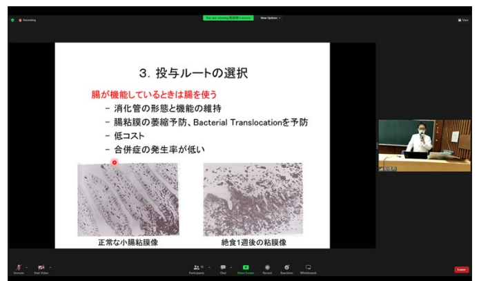
A presentation slide displayed on screen.

Picture taken at: Kyushu University Hospital