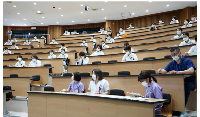
Workshop view at Kyushu University Hospital.

Picture taken at: Kyushu University Hospital