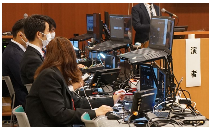
Engineers establish a connection behind the venue.

Picture taken at: Kyushu University Hospital