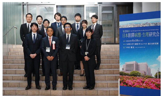
A group photo at Kyushu University Hospital.

Picture taken at: Kyushu University Hospital