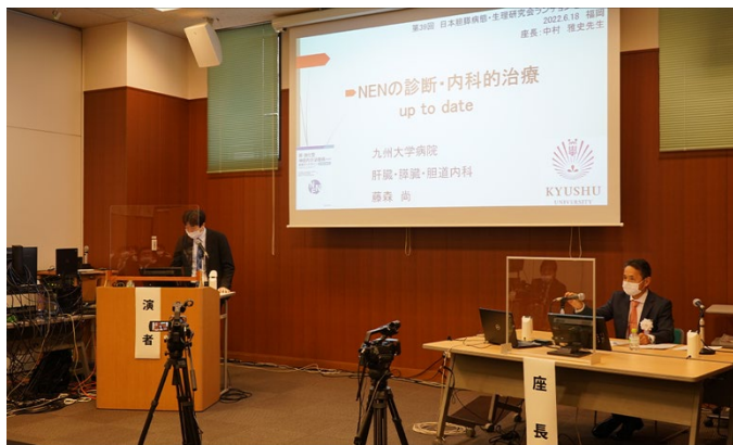
Teleconference view at Kyushu University Hospital.

The 39th annual meeting of Japan Society for Bilio-Pancreatic Pathophysiology was held on June 19th, 2022. A total of 37 presentations and two special lectures were presented in the meeting. There were 108 participants, of which, 71 were on-site and 37 were online. A fruitful discussion was held in the meeting.