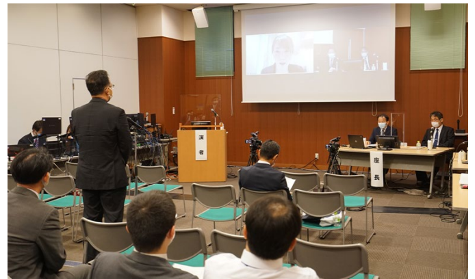
Teleconference view at Kyushu University Hospital.

Picture taken at: Kyushu University Hospital