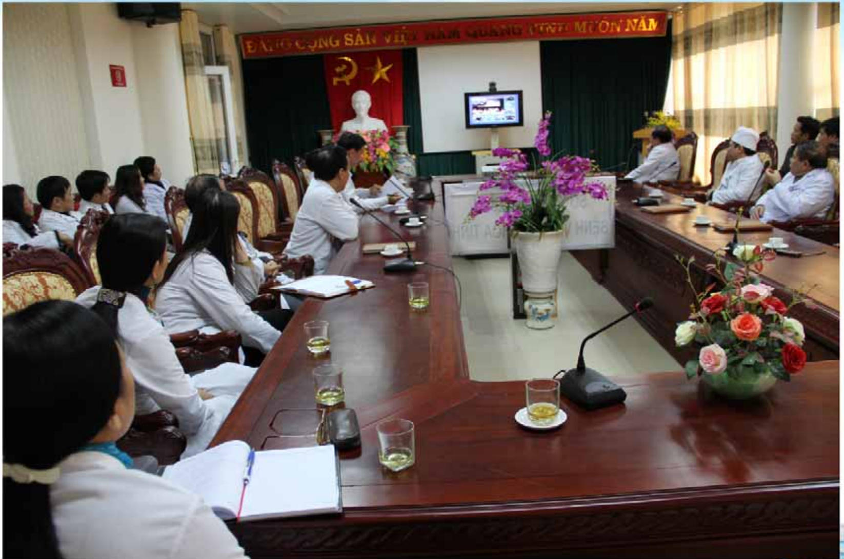
Teleconference with Bach Mai Hospital