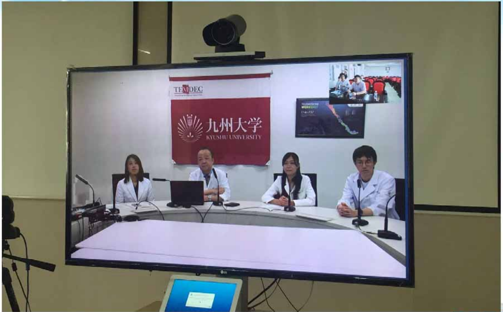
Teleconference with Kyushu University