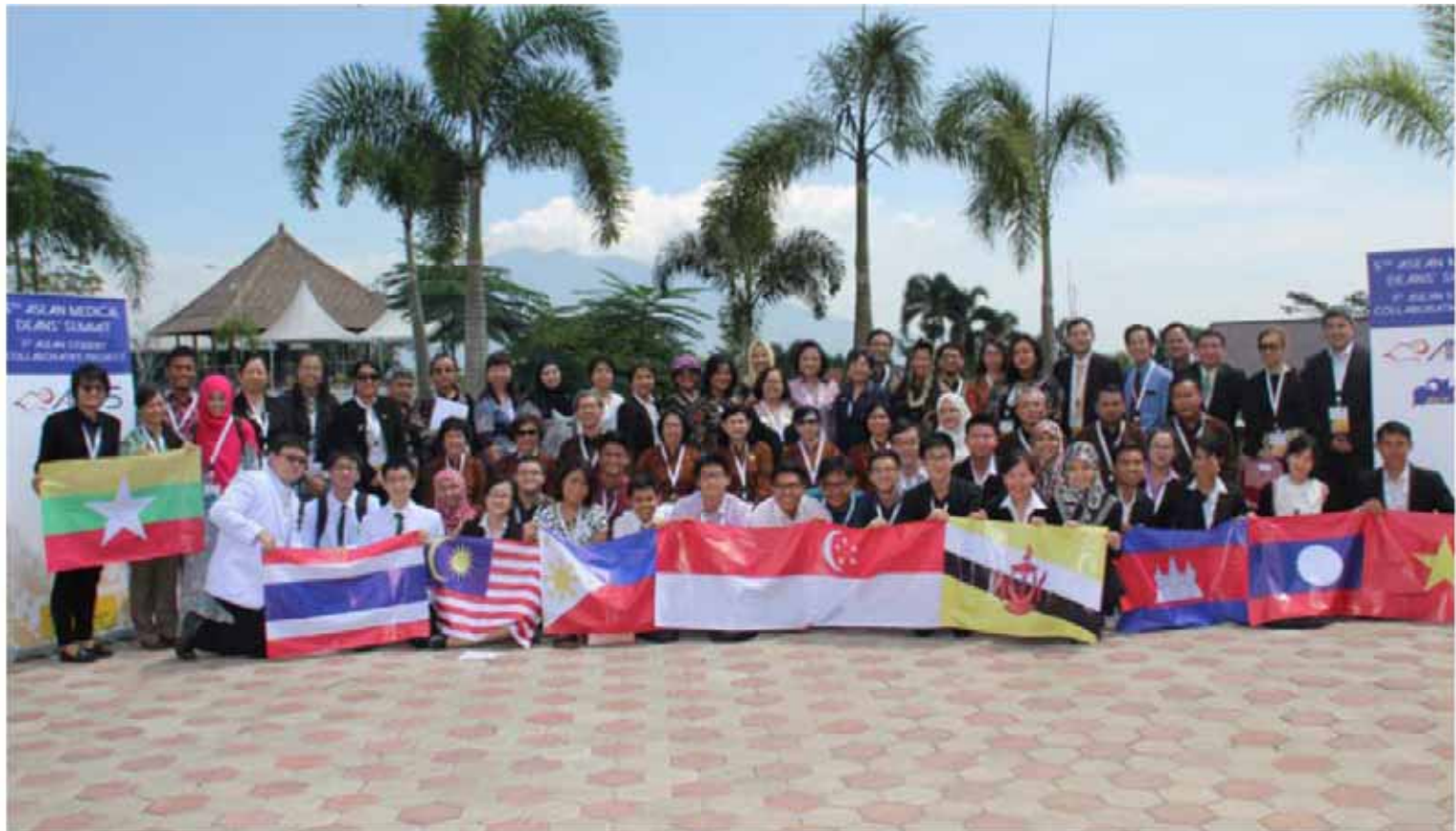
AMDS and ASCP delegates after opening ceremony