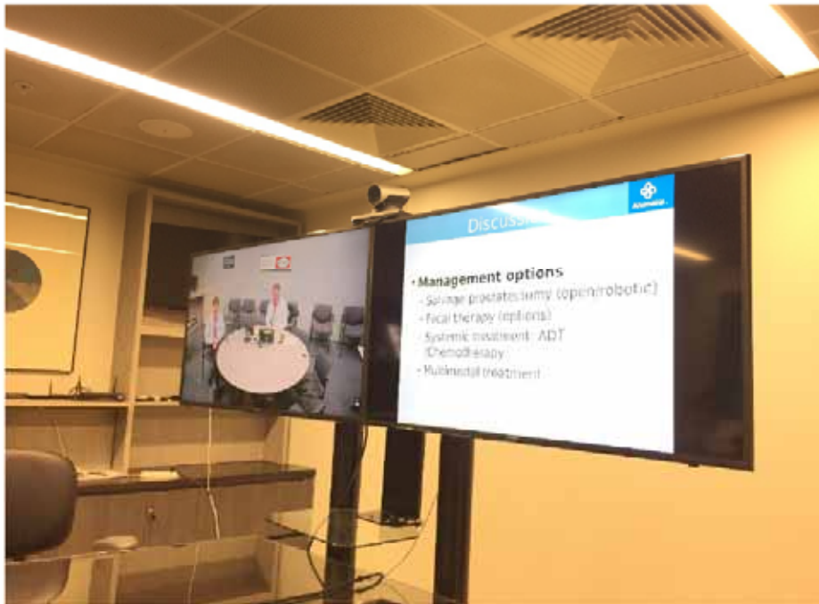
New Telemedicine Equipment