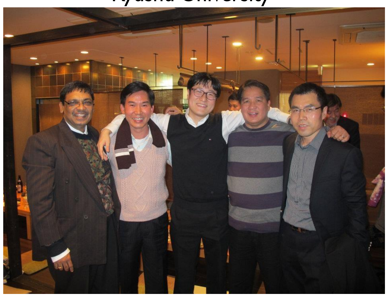
New bonds forged during the symposium