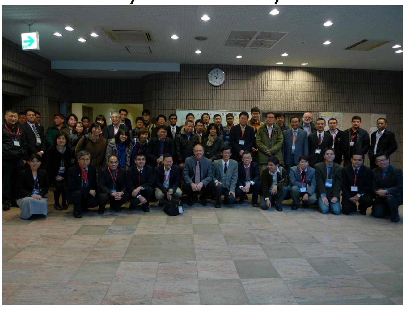
Attendees of the 6th Asia Telemedicine Symposium, December 2012