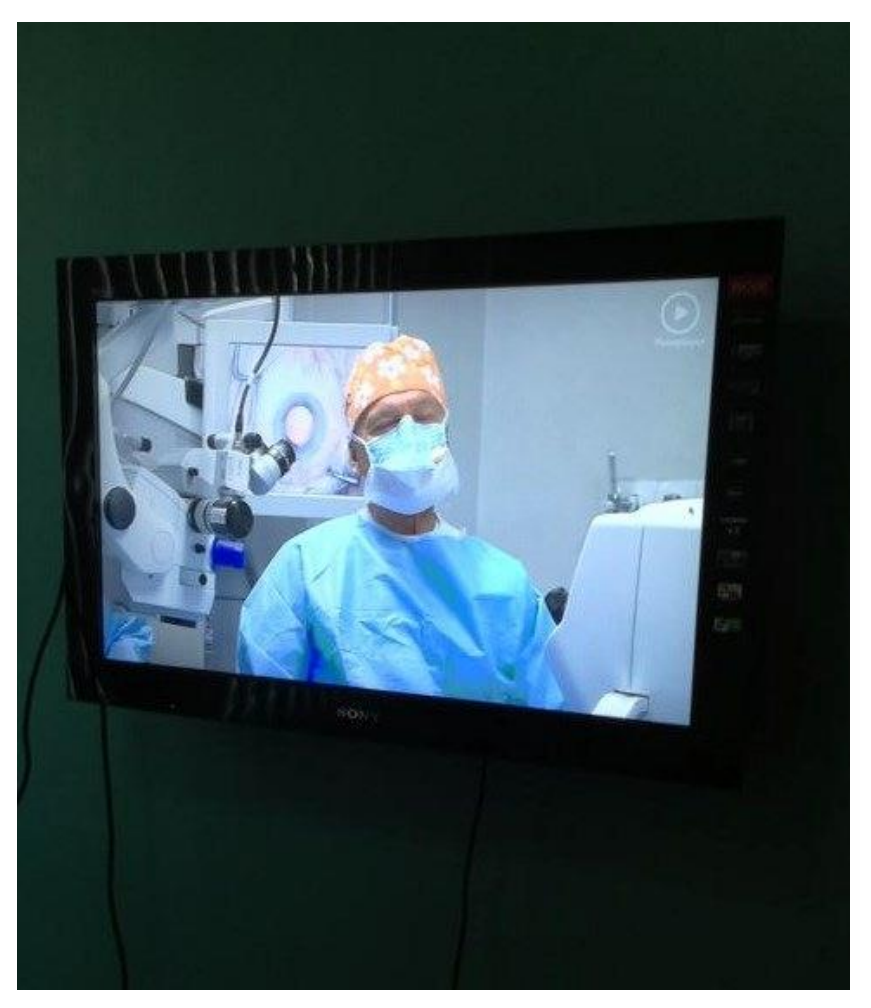
Still shot of the live feed from the Zlin Ophthalmology Festival