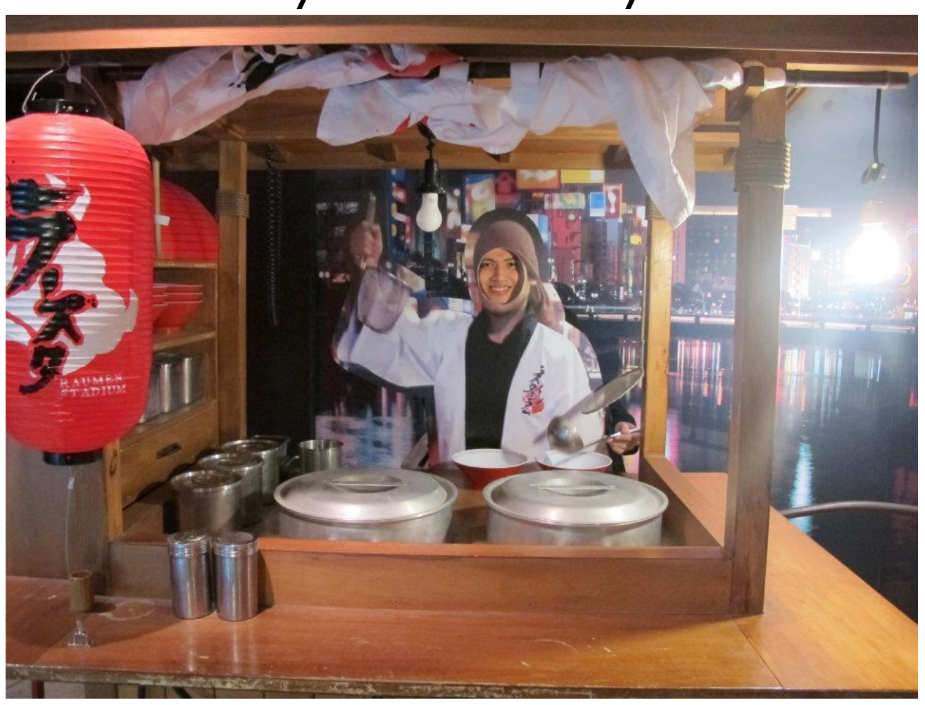
Filipino-looking ramen server, Japanese Kaloka-like