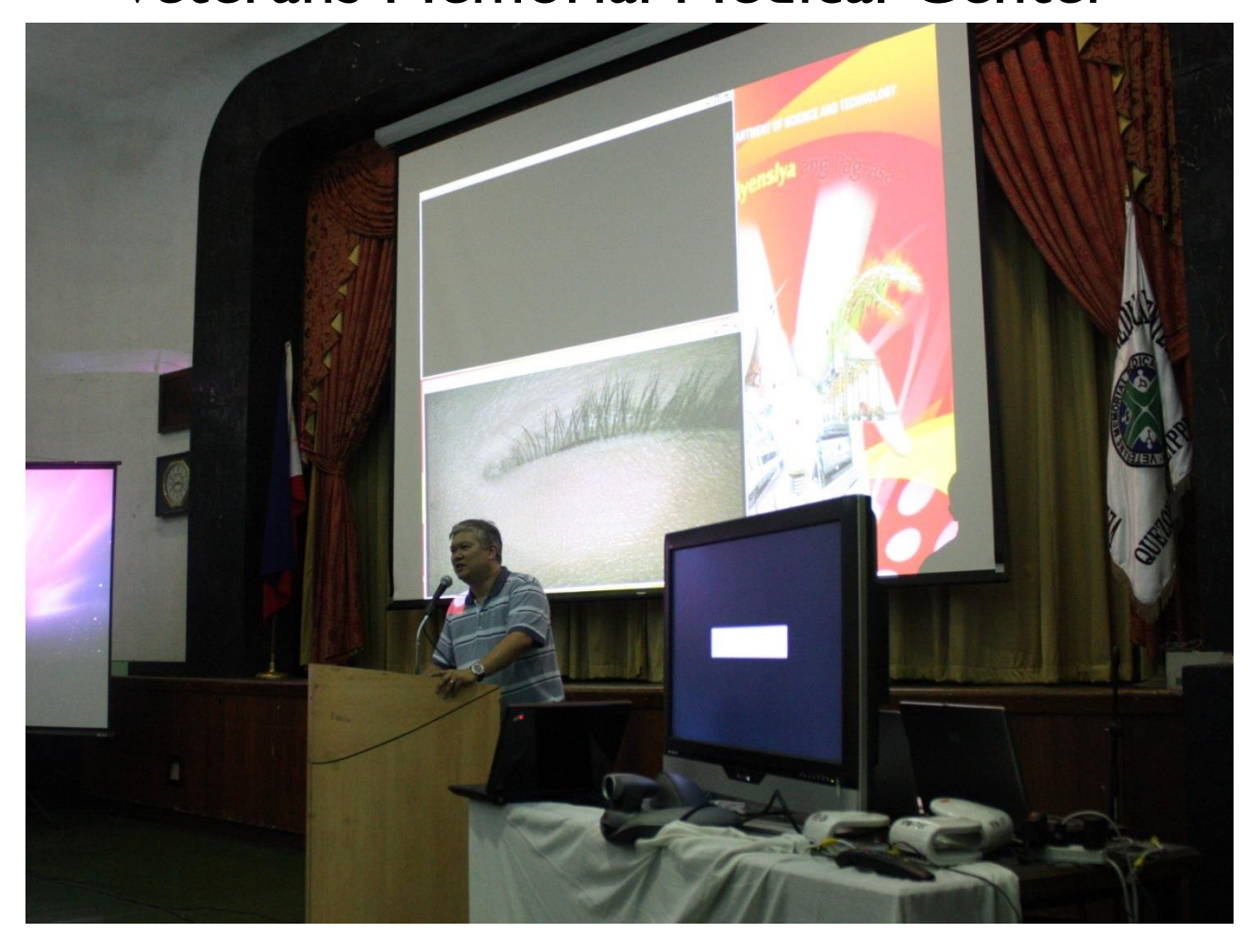
Linking of Conference Hall, Eye Clinic, Operating Room