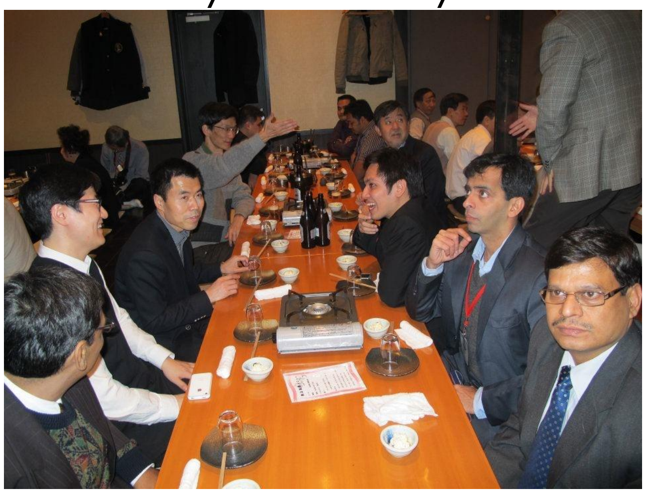
The delegates enjoying dinner and a few drinks after a successful 2-day symposium