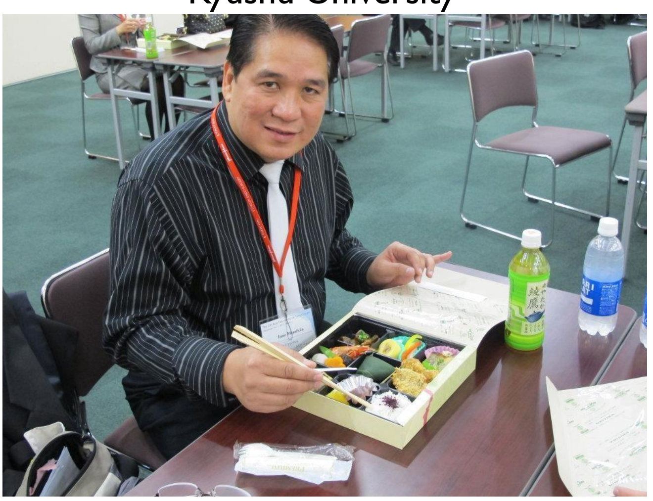
Lunch is served, at the Symposium on day I.