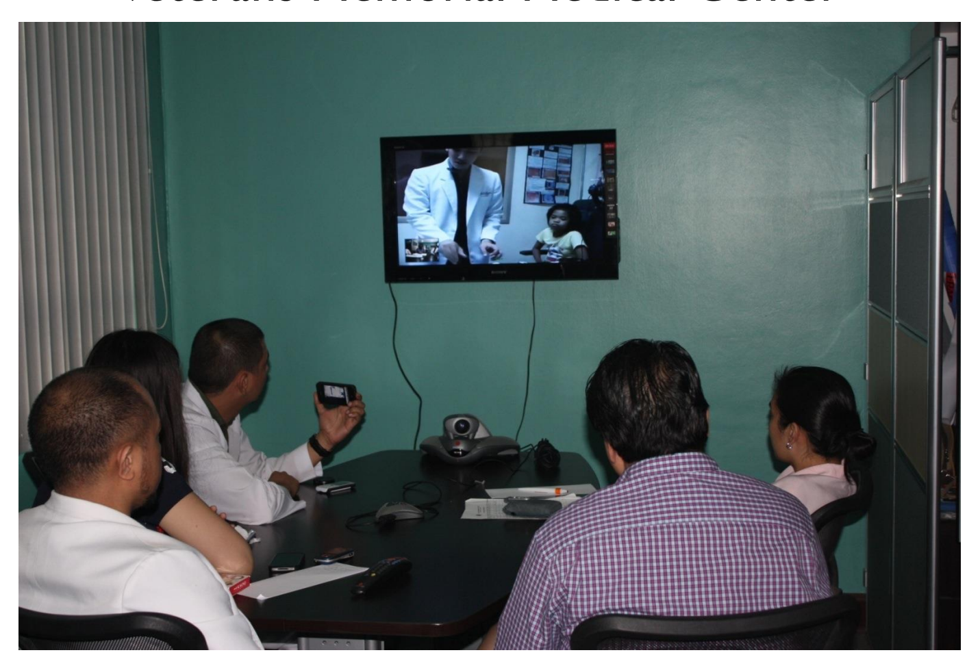
Venture of VMMC Department of Ophthalmology and DOST-ASTI in Telementoring