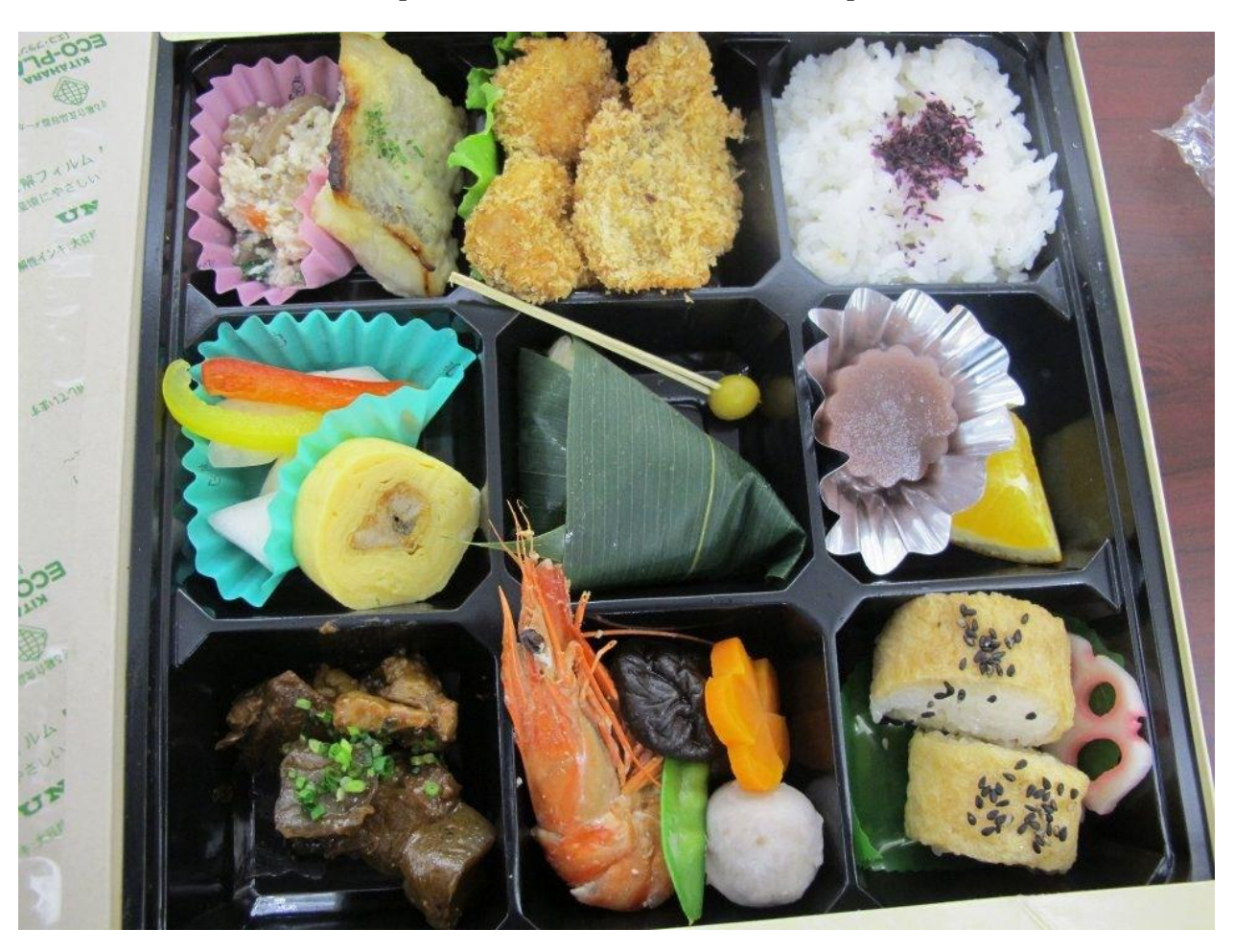
The art of Japanese cuisine