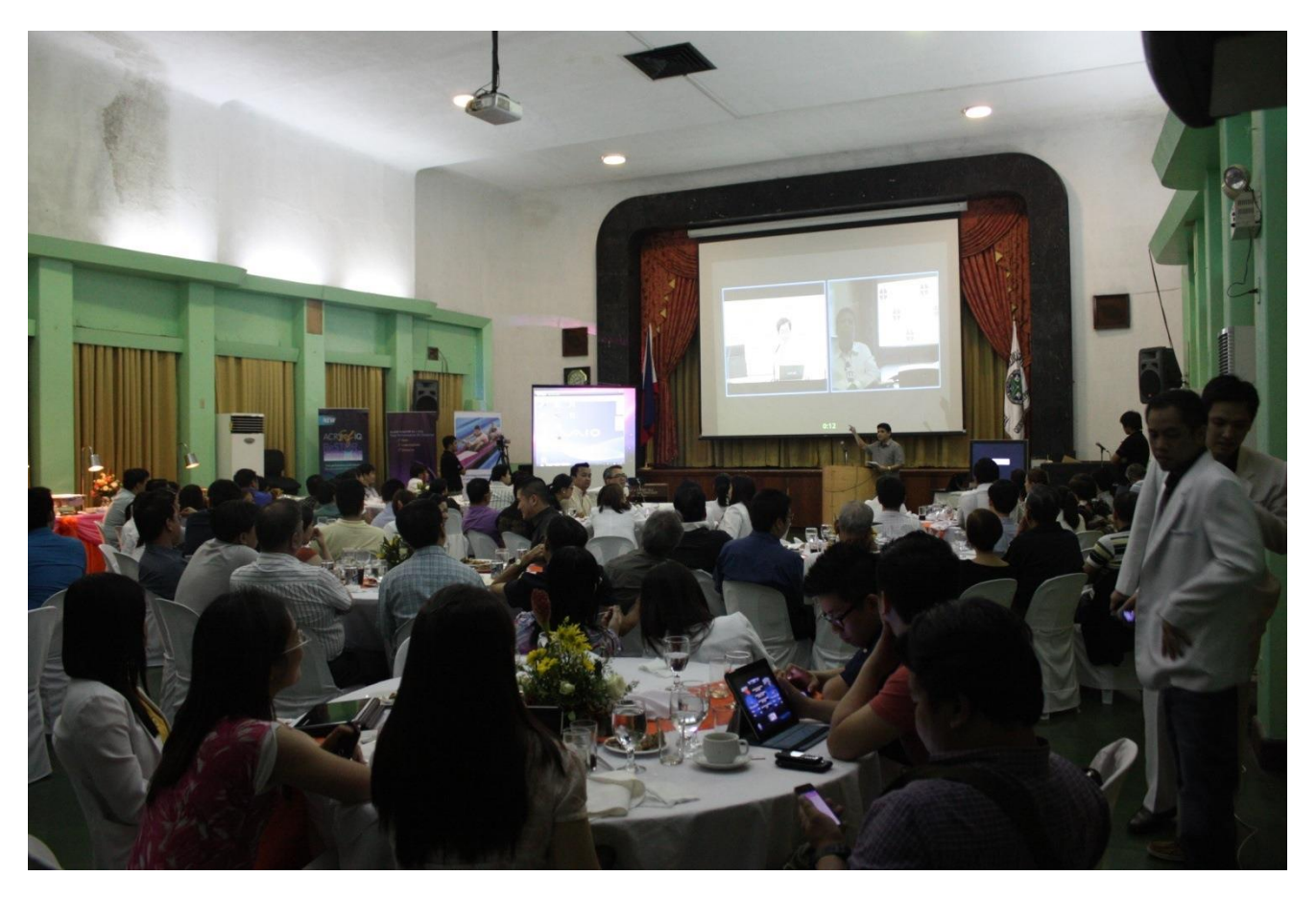
Linking of Conference Hall in VMMC, Philippine Heart Center, and Kyushu University, Fukuoka, Japan