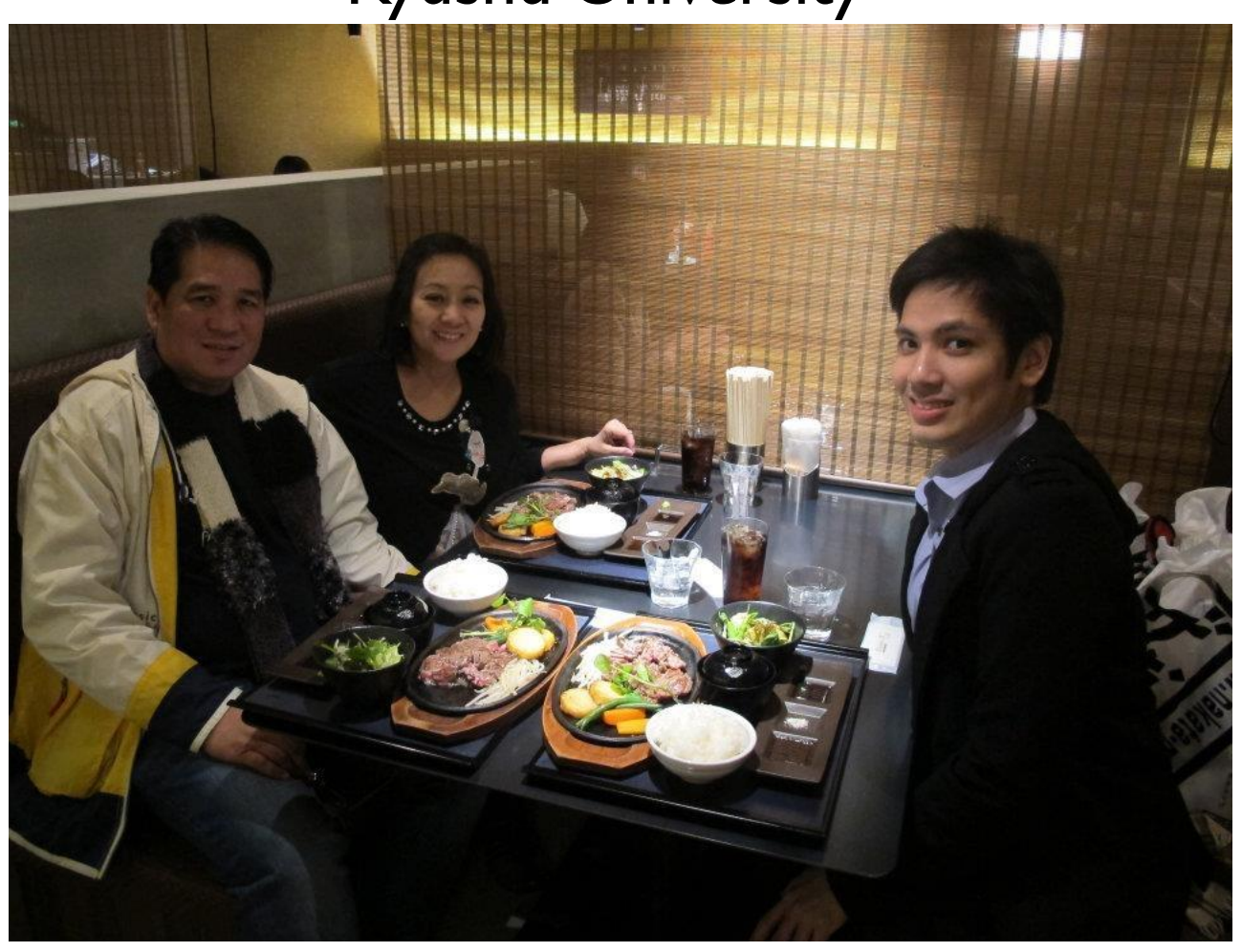
Enjoying the dinner in Fukuoka, Japan