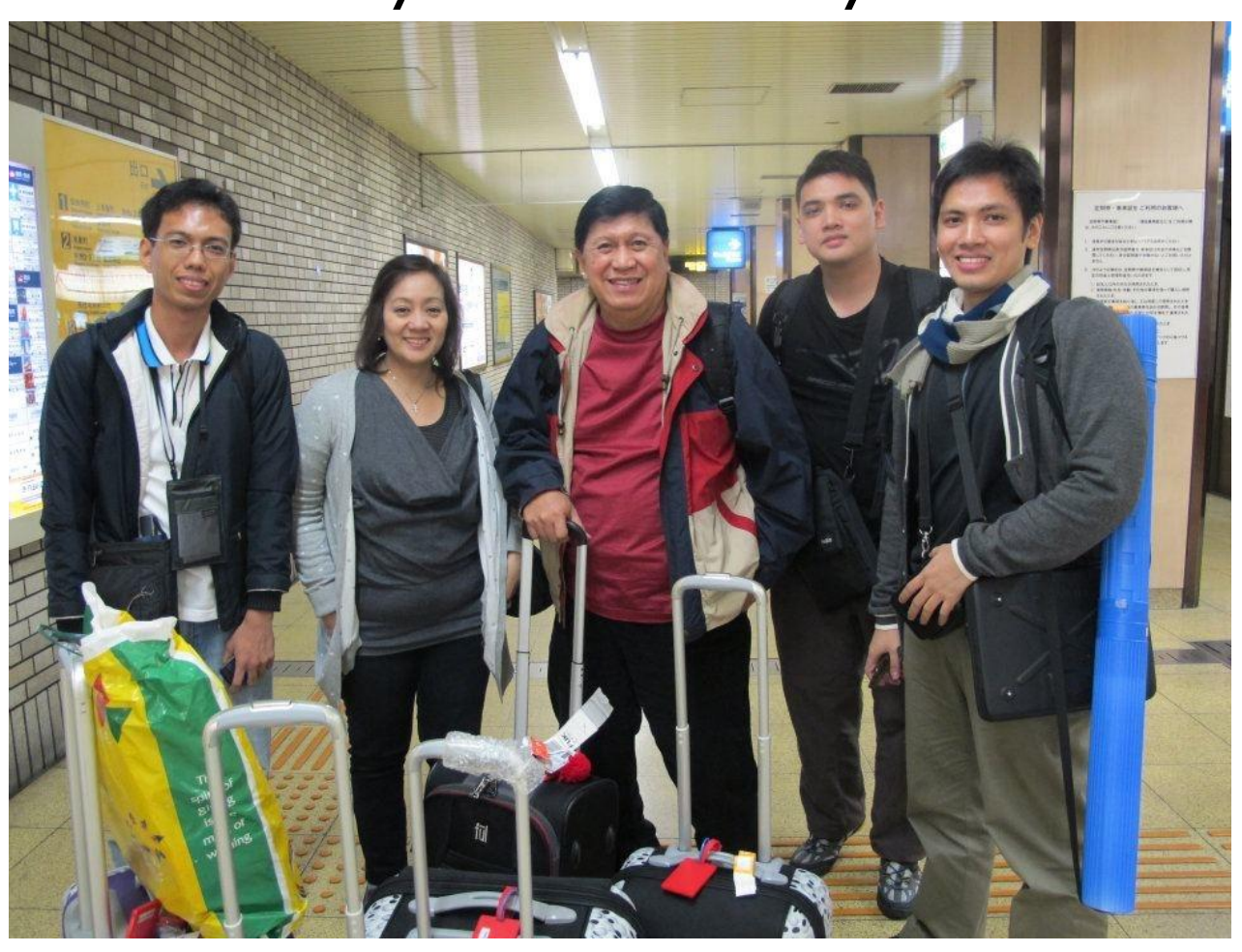
The Philippine Team