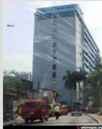
St. Luke's College of Medicine