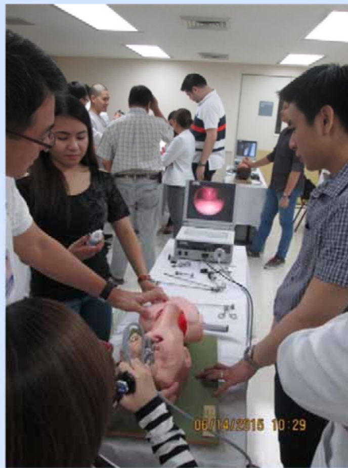
Basic Bronchoscopy Workshop