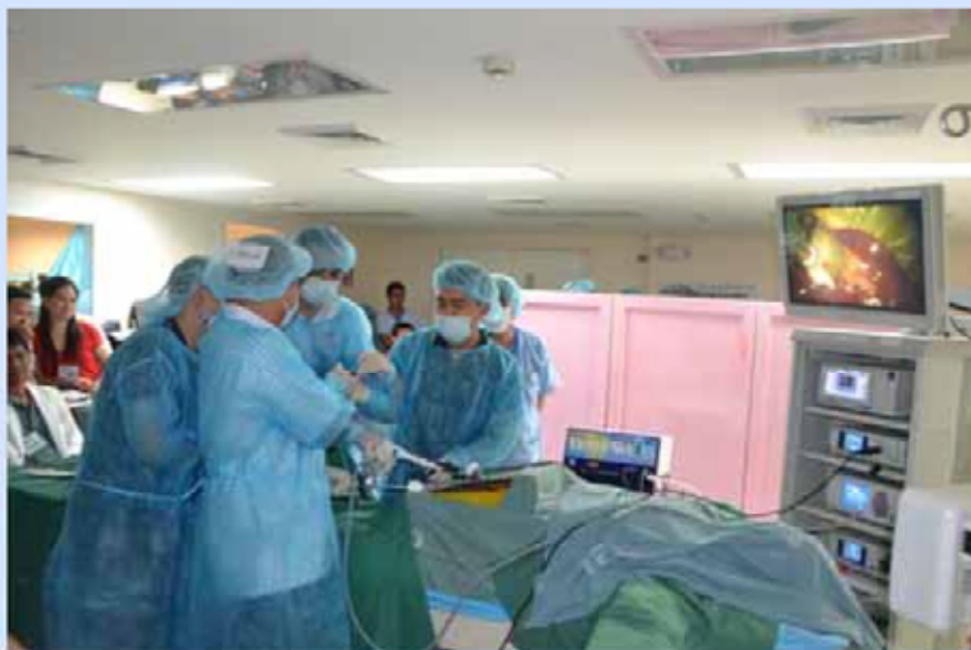
MIS Team Training