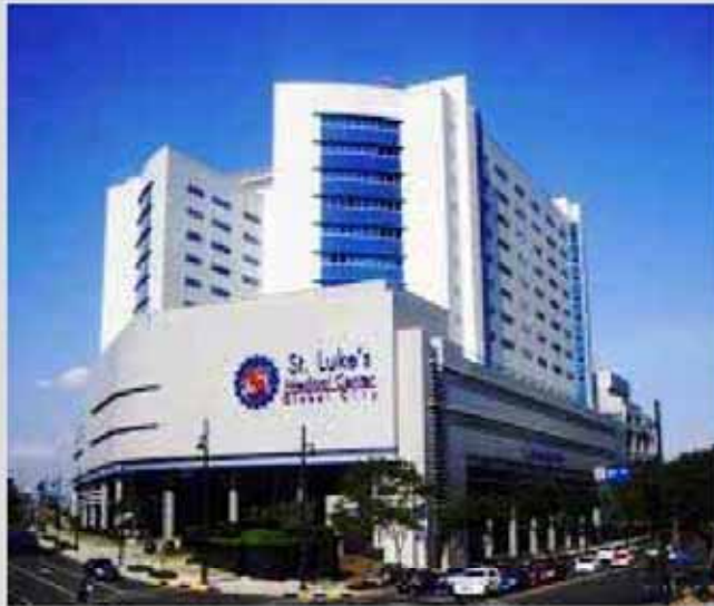
SLMC- Global City