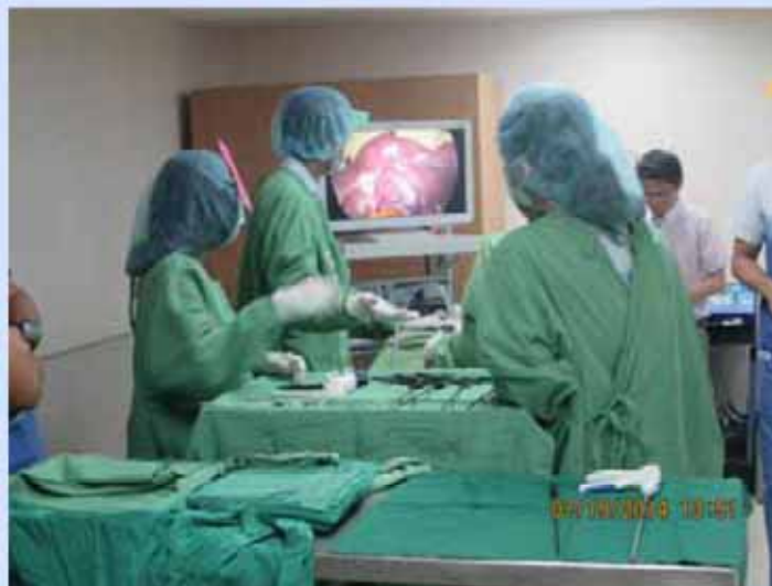
MIS Team Training