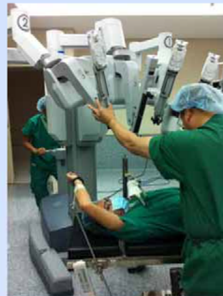
Robotic Surgery Training