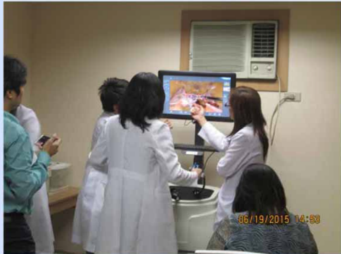
MIS Virtual Reality Laparoscopic Skills Simulator