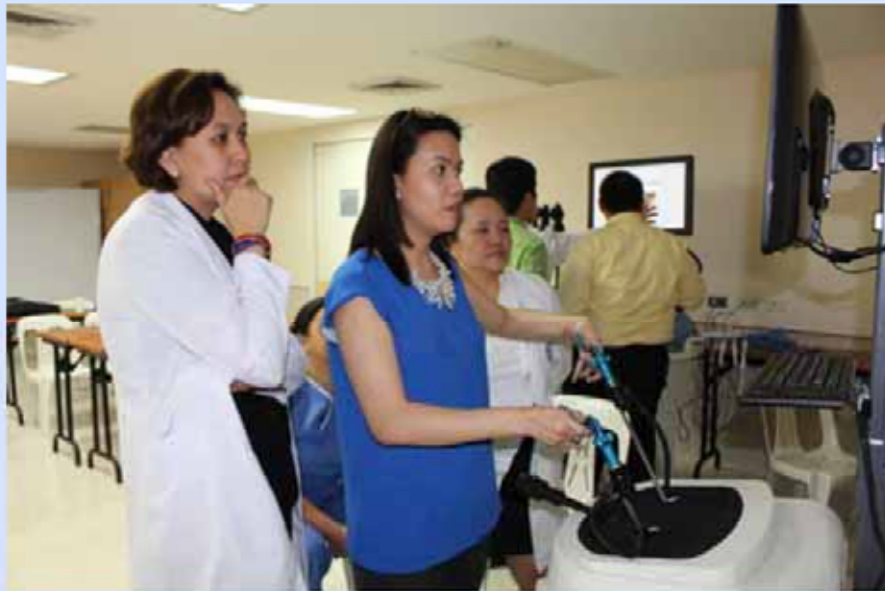
MIS Skills Dev't and Research