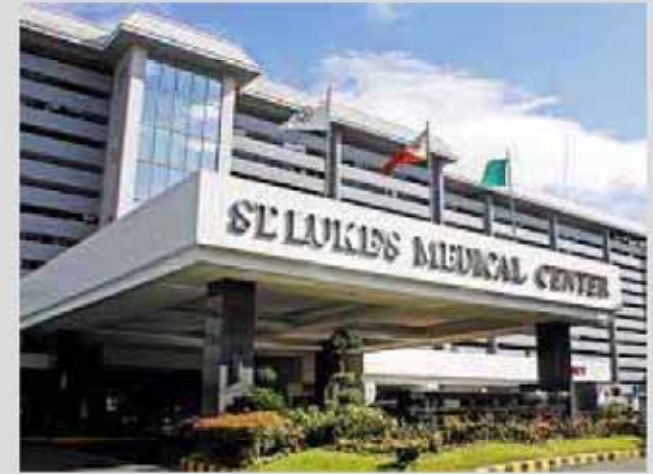
SLMC- Quezon City