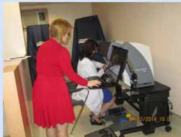
Robotic Surgery Simulator