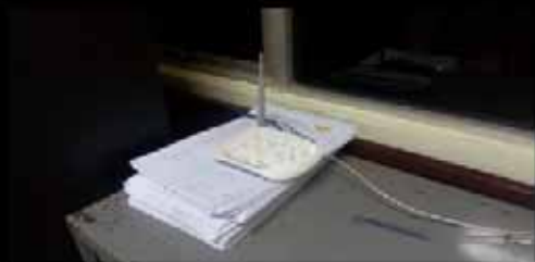
TELKOM SPEEDY ADSL WITH ROUTER