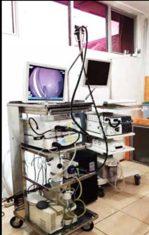
FUJINON EPX 4 450 HD