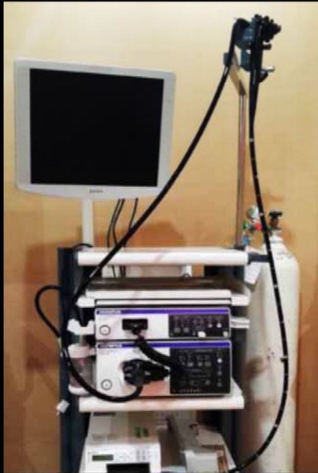
Fujinon CDL 1909 A PV 490A 178