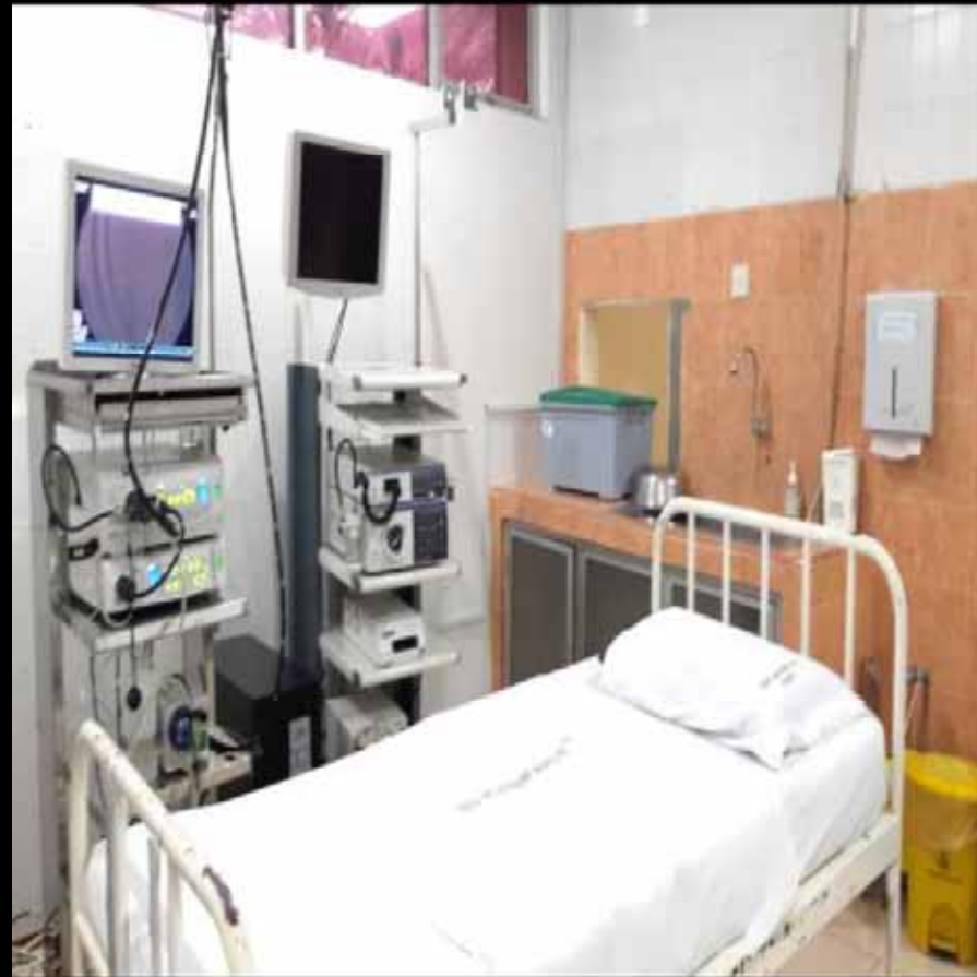
OLYMPUS EVIS EXERA III