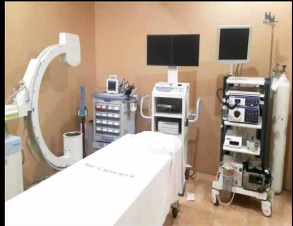
OLYMPUS EVIS EXERA III