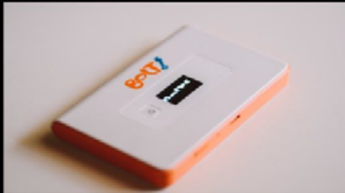
BOLT! SUPER 4G LTE