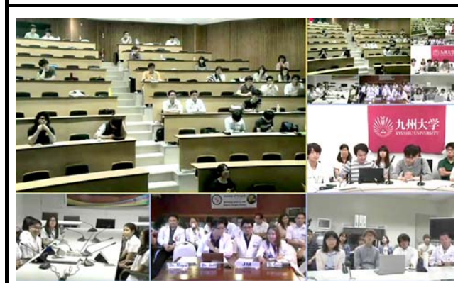
Monitor shows connected site.