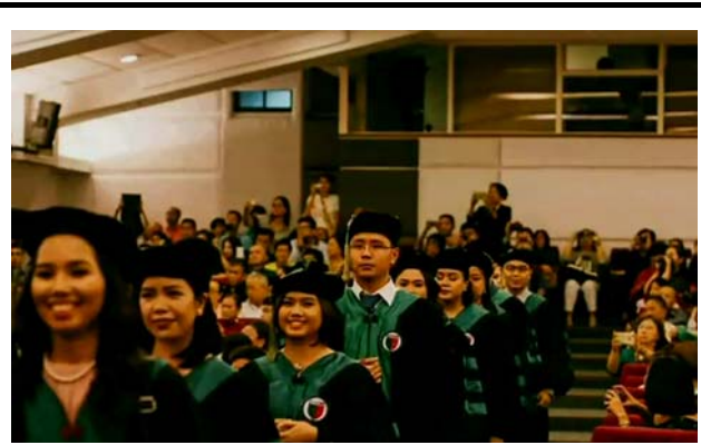
A presented picture.