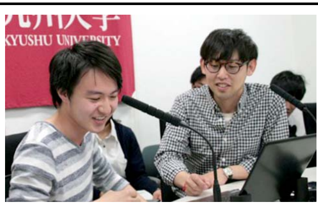
The students make a presentation.