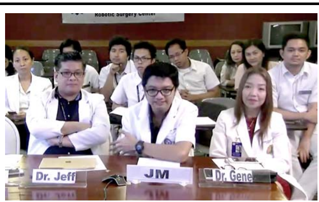
Teleconference view at St. Luke's Medical Center Quezon City.