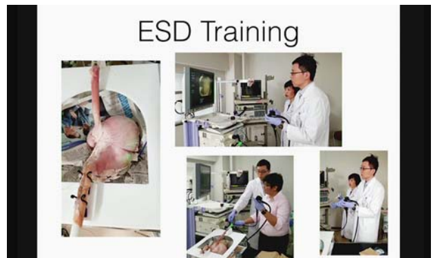
A presented surgery movie. Picture taken at: Kyushu University Hospital