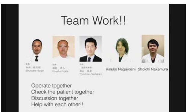
A presented slide. Picture taken at: Kyushu University Hospital