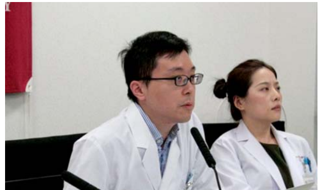
Teleconference view at Kyushu University Hospital. Picture taken at: Kyushu University Hospital