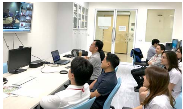
Teleconference view at National Cancer Center Hospital.